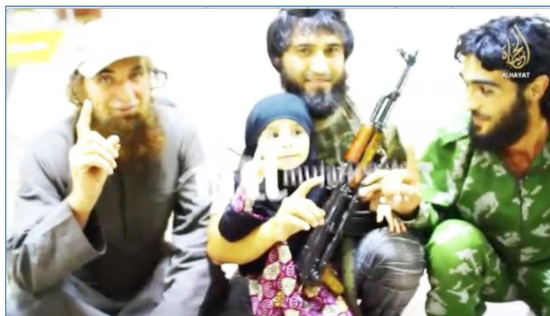
Figure 6. A still from mujatweet 8.

Al-Hayat, a well-branded production company in the Islamic State, has, so far, produced eight short films called mujatweets, a play on mujahidin (people who perform jihad) and "tweet" to show they are short. 15 They are designed to show the utopia the Islamic State offers and are available in many languages. They include all generations (boys and girls and men of all ages but no women) and a range of races (one mujatweet features only happy blond Bosnian children), they stress the camaraderie and joy of living in a utopia, and they show a land of plenty, where the markets are full of fresh produce and the meals are generous, and where children in the park are handed candy floss and chocolate by smiling fighters. There is even a mujatweet profiling a shawarma seller. The fight, however, is never sidelined: guns are omnipresent, with most featured men clearly fighters, even when children are profiled. (See Figure 6 for a still from mujatweet 8.) There is no mistaking the message that the next generation of the Islamic State is made up of diverse, happy, committed, and militant citizens.