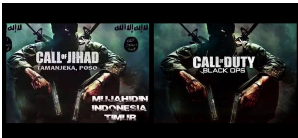
Figure 1. Call of Jihad co-opted the Call of Duty branding entirely

Messages from ISIS come in many forms, cleverly targeted to many audiences, including their enemies. These include video games that mimic already popular products, such as Call of Duty, which, reinterpreted as Call of Jihad, copies much of the style and design of the original (see Figure 1). Grand Theft Auto retains the name but with the added subtitle Saleel as-Sawarim, or Clash of Swords (see Figure 2). (This name is used for many other products, from historical television series to the nasheeds , or chants, of the Islamic State.) The backdrops were changed to reflect the scenery of the battles in Northern Syria and Iraq; the enemies wear US military uniforms. The target audience is clear: young men, the overwhelming demographic who play Grand Theft Auto, as illustrated by a British jihadi interviewed by the BBC after he traveled to Syria to fight who said that life with ISIS is “better than that game Call of Duty.” 4 An Islamic State official was quoted as saying that the game’s goal is to “raise the morale of the mujahedin and to train children and youth how to battle the West and to strike terror into the hearts of those who oppose the Islamic State.” 5