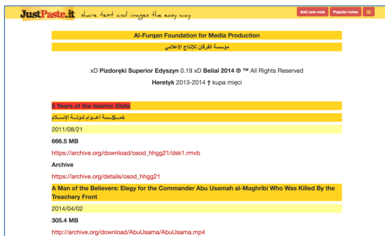
Figure 4. Example of a Justpaste.it page from Al-Furqan, a production company in the Islamic State

ISIS even created their own app for android phones, the Dawn of Glad Tidings (see Figure 5). When downloading the app, users sign away their privacy rights, giving ISIS access to their contacts and, crucially, their twitter account. J. M. Berger describes what happens next: