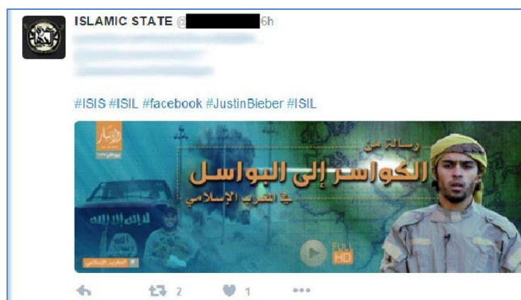
Figure 3. Hashtag hijacking: this tweet from ISIS randomly includes #JustinBieber to capture Justin Bieber fans

Twitter has been a useful medium for spreading the ISIS message, especially during the crucial early days of the Islamic State's declaration of a caliphate, in June 2014. 9 ISIS successfully seized on the methodology of "hashtag hijacking," adding to their tweets the hashtag of whatever was trending at that moment. Figure 3 shows a tweet from an ISIS account that includes #JustinBieber. Though very few of those who click further will be sympathetic to the movement, to ISIS, with formidable manpower at their disposal, the ability to draw in the tiny fraction of 1 percent who are already susceptible is worth the effort. Twitter's recent shutting down of these accounts has been remarkably successful in limiting the reach of ISIS on their platform, though this action could not completely silence extremist voices. 10