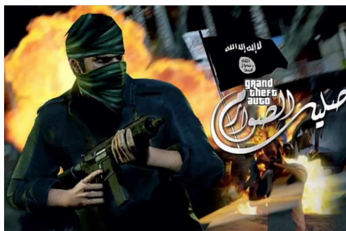
Figure 2. Grand Theft Auto, with the ISIS flag and “Saleel as-Sawarim” in Arabic