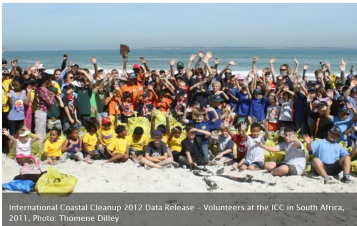
International Coastal Cleanup 2012 Data Release - Volunteers at the ICC in South Africa, 2011.

COASTSWEEP is part of the International Coastal Cleanup (ICC) organized by Ocean Conservancy in Washington, DC. Through the efforts of the ICC, volunteers from all over the world collect marine debris and record information about the trash they collect. This information is then analyzed and used to identify sources of debris and to develop education and policy initiatives to help reduce marine debris globally.