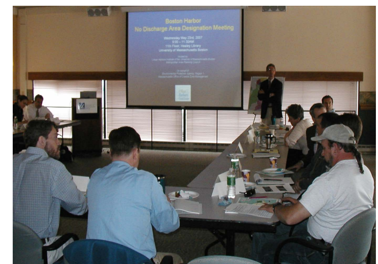
Harbor masters, scientists, and coastal managers meet to discuss the Boston Harbor No Discharge Area designation

• The Nantucket Shellfish Management Plan – Fishermen, scientists and community members shared information and provided guidance for a management plan to sustain shellfish resources, improve habitat, and ensure the future of a highly-valued industry.