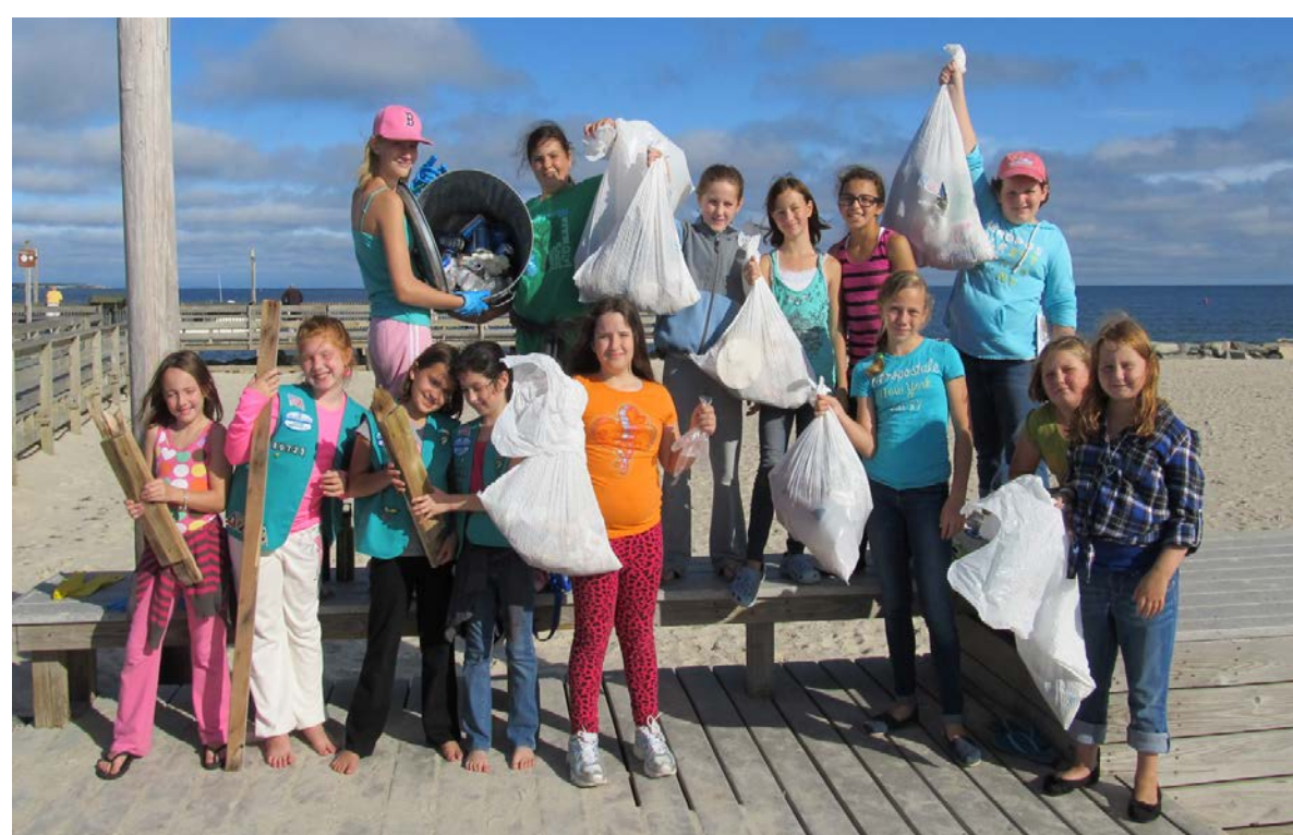
Brownie Junior and Cadet Girl Scouts participate in a COASTSWEEP event

Many of UHI's projects and activities either directly or indirectly contribute to enhanced public education about the marine environment.