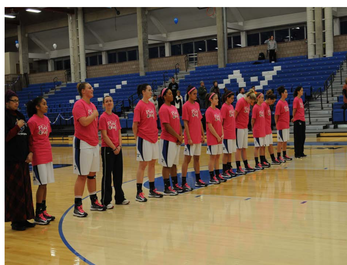
Women's Basketball “Play for Kay” Breast Cancer Awareness