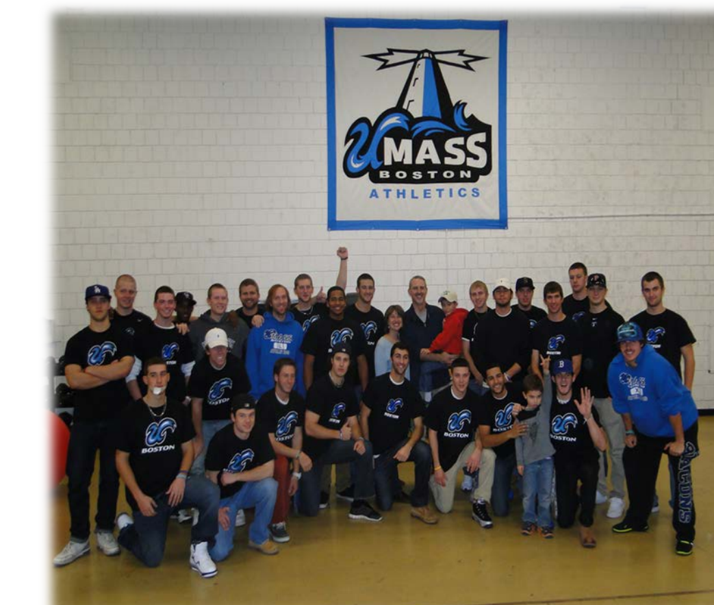
Men's Baseball Team IMPACT