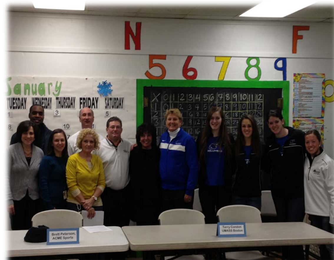
Women's Volleyball Boys & Girls Club