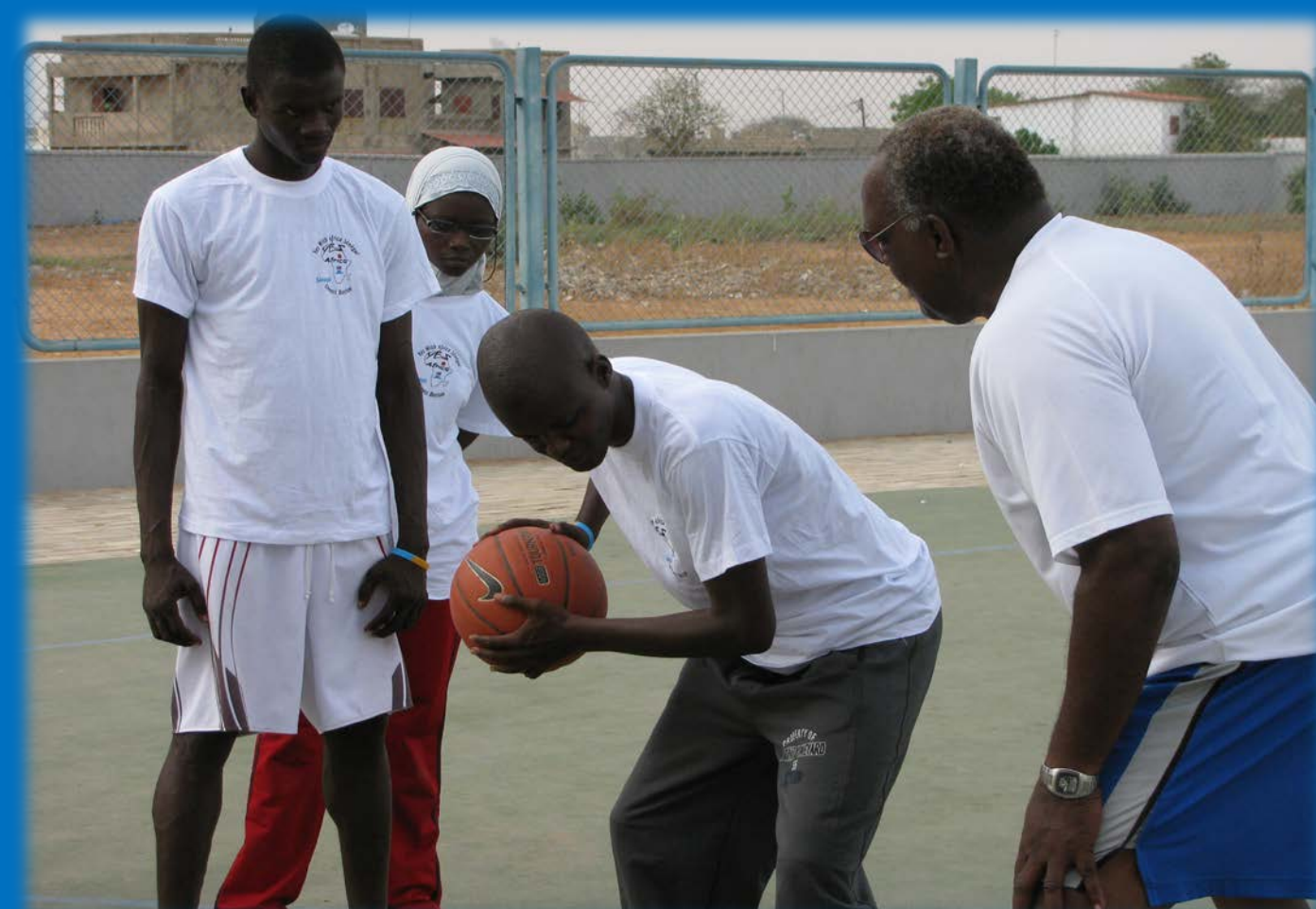
YES with Africa

More than 150 school, charitable, governmental, and private organizations use UMass Boston athletic facilities for over 2,100 hours each year as participants or spectators. Along with the university's Office of Community Relations and the Division of Student Affairs, the division provides staff support to the Urban Mission Coordinating Committee and manages the Harbor Point Agreement to ensure harmonious neighborhood relations. With the Department of Africana Studies, the Division implements the international exchange program YES (Youth, Education, and Sports) with Africa, a multiethnic, coeducational sports and leadership initiative that is currently based in Senegal and Benin and has served over 1,500 African youth.