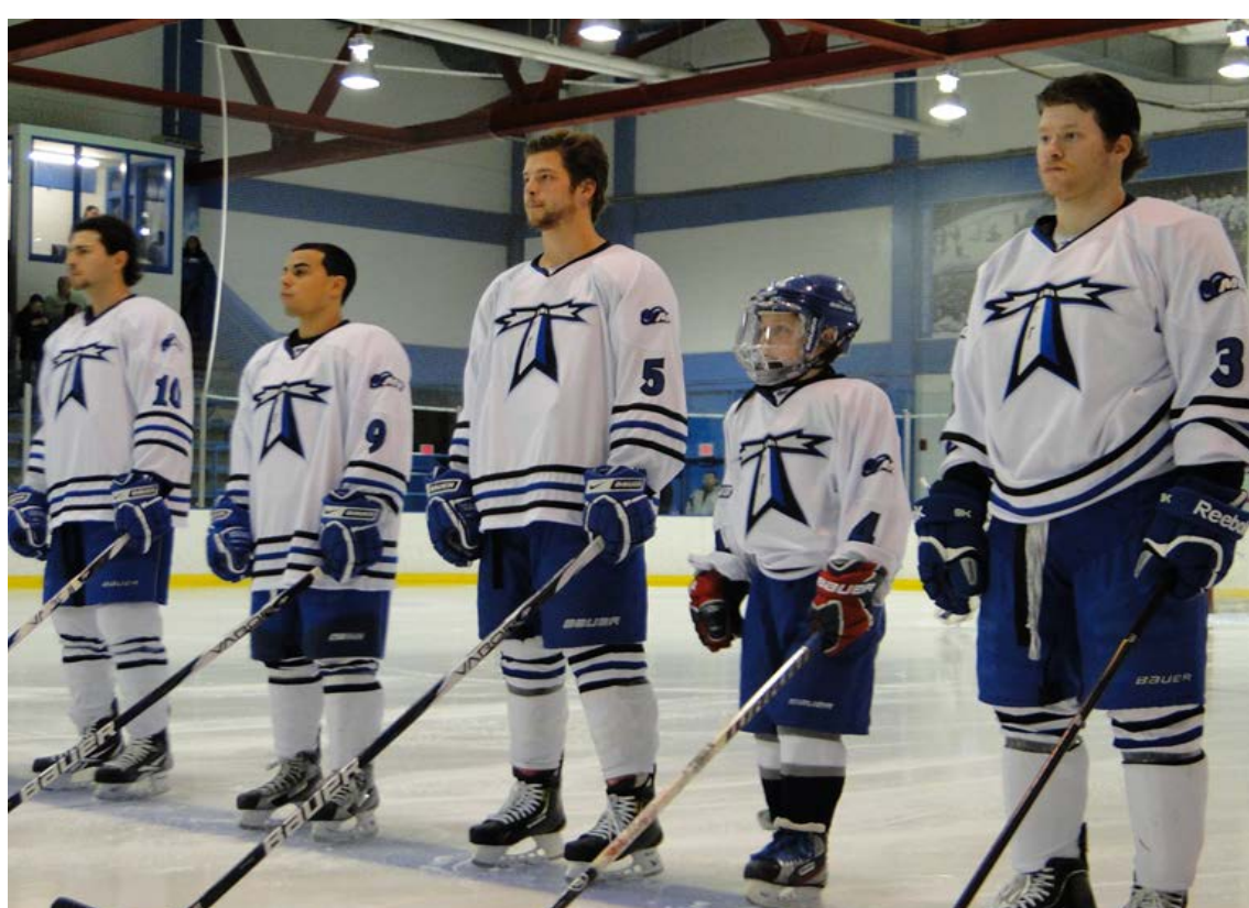
Men's Hockey Team IMPACT