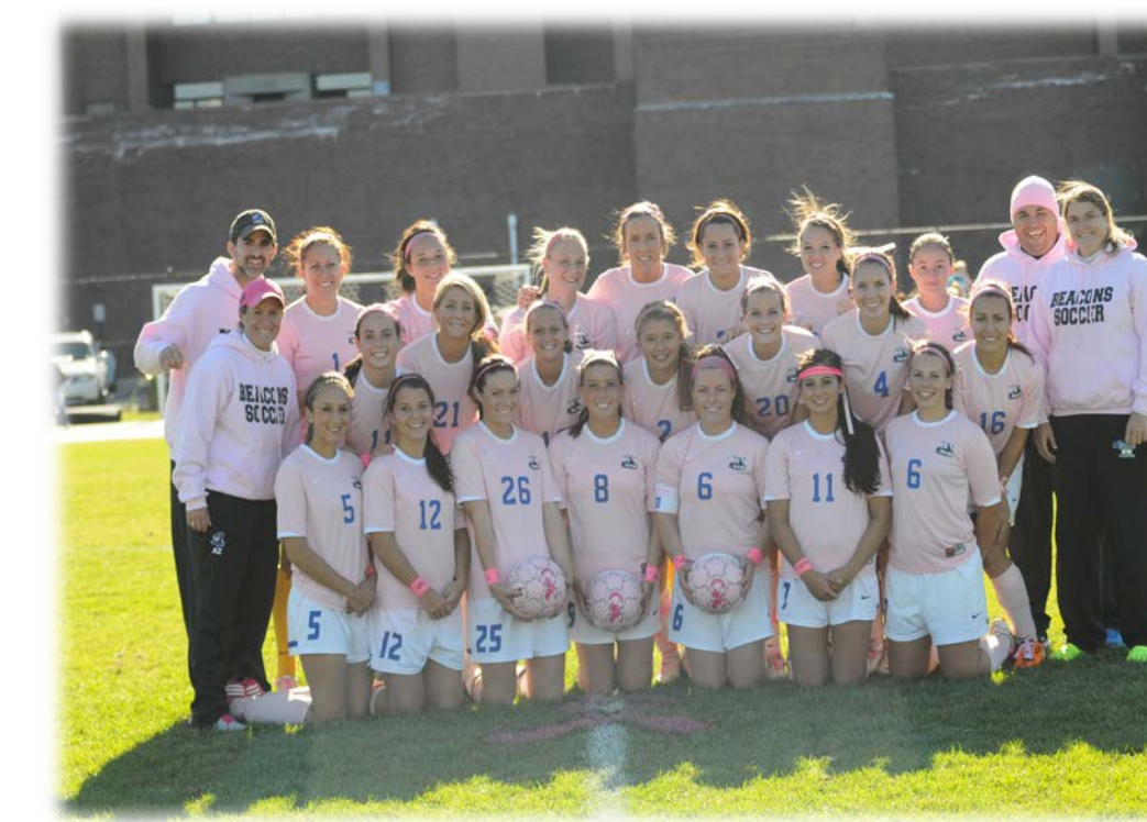
Women's Soccer Think Pink Game

America Scores Boston Buddy Walk for Down Syndrome Boston Medical Pediatric Visit Boston Scholar Athletes Boys & Girls Club Breast Cancer Walk Bruins Coaching Symposium Champs Boston City Volleyball Clinic Cradles To Crayons Dream Big Fidelity House Clinic Food for Hunger UMass Boston Franklin Park Coalition Fundraising Clinic in Conjunction with PrimeTime Lacrosse Helping Hands UMass Boston Homes for Our Troops Build a Home Homes for Our Troops Auction Hyde Park DCF KP basketball clinic King Philip High School Lawrence Family Development Charter School Malden Youth Basketball MassPirg Meriting Attention Basketball Clinic MLK Day of Service Nantucket Boys and Girls Club Pan Mass Challenge Pan Mass Challenge Cancer Research Promising Pals Program Read for the Record Revere Girls Softball League Rosie's Place Score Boston Think Pink U-Access Food Pantry