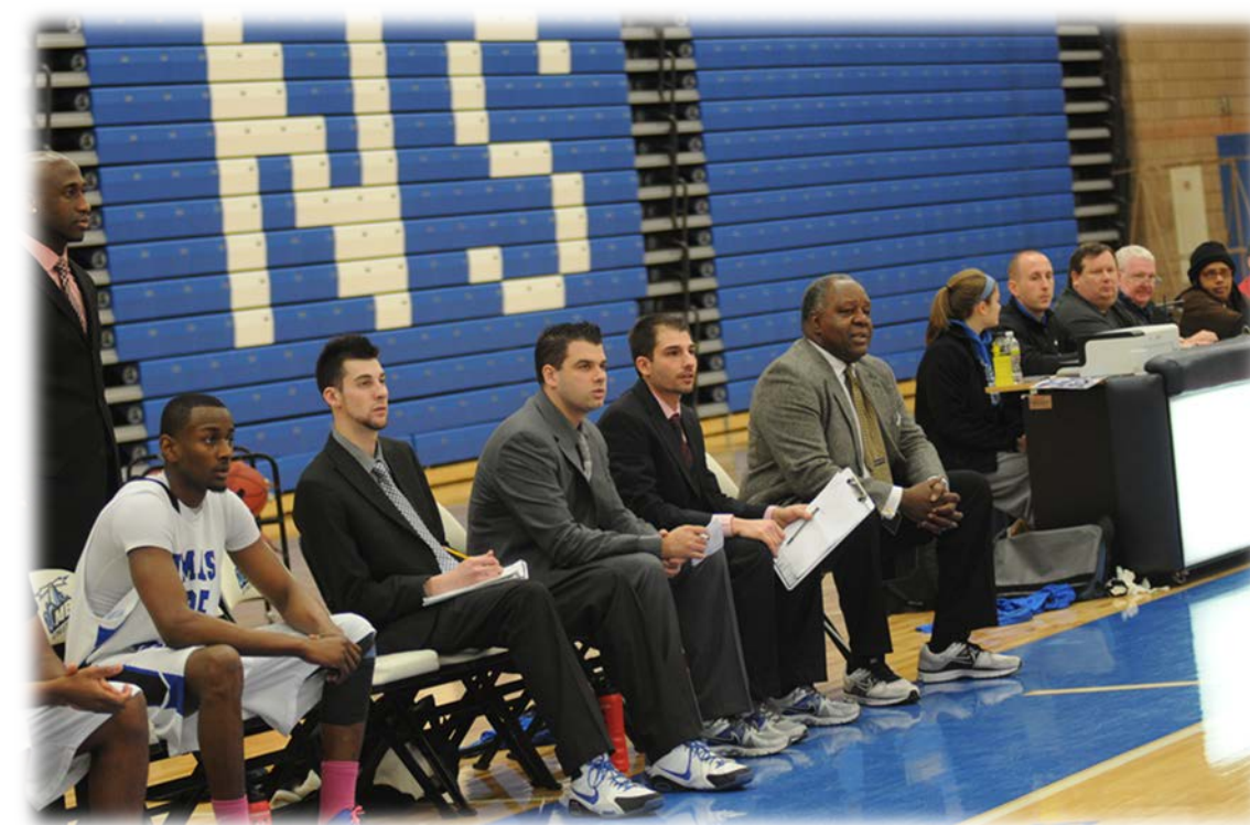
Men's Basketball Coaches vs. Cancer