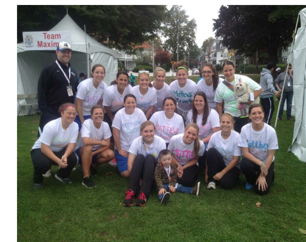
Women's Softball Down Syndrome Walk