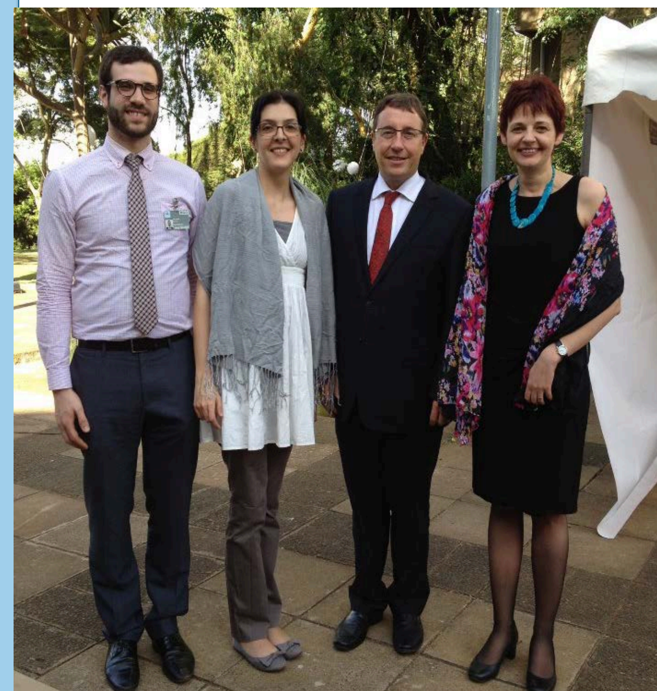
Center for Governance and Sustainability delegation with UNEP Executive Director Achim Steiner

Bringing analytical rigor into policy processes at the global level, the center has actively engaged with the UN and participated in the 2012 Rio+20 conference in Brazil and in the 2013 UN Environment Assembly in Nairobi, Kenya. We produce a documentary film series on global environmental governance featuring interviews with ministers, international organization officials and public intellectuals from around the world.