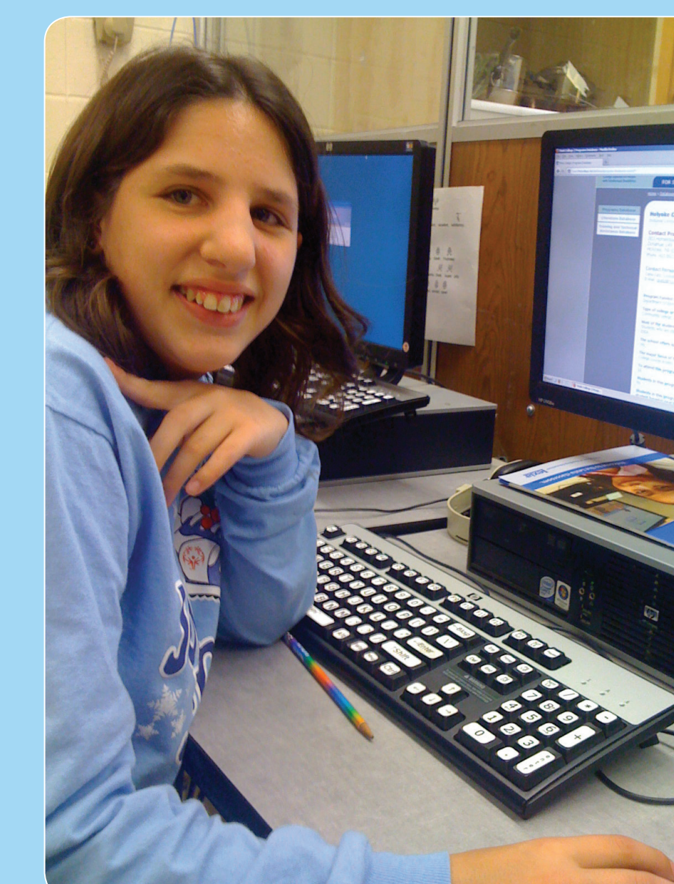
Students advise Think College staff on website as well as contribute their own content