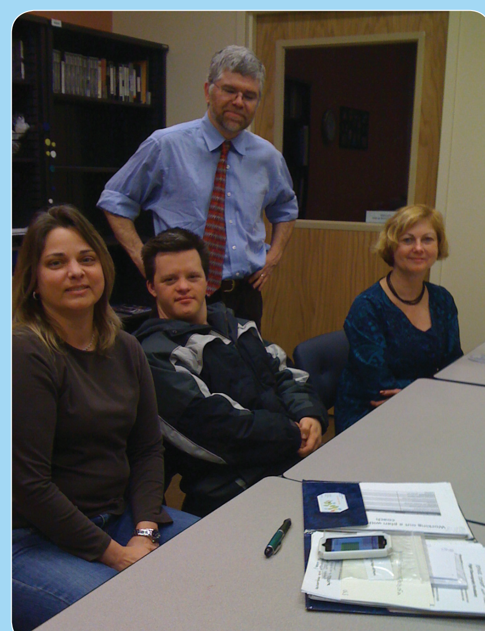
Students co-author Think College briefs

The following research questions guided three separate research projects with secondary and postsecondary students with IDD: (1) How do students with IDD use digital media tools to engage in research? (Participatory Action Research) (2) Which features of print and web-based resources do students with IDD identify as being the most accessible, engaging, and important? (Accessible and Usable Information research) (3) What recommendations do students with IDD have to improve the Think College database? (Usable Database Redesign research)