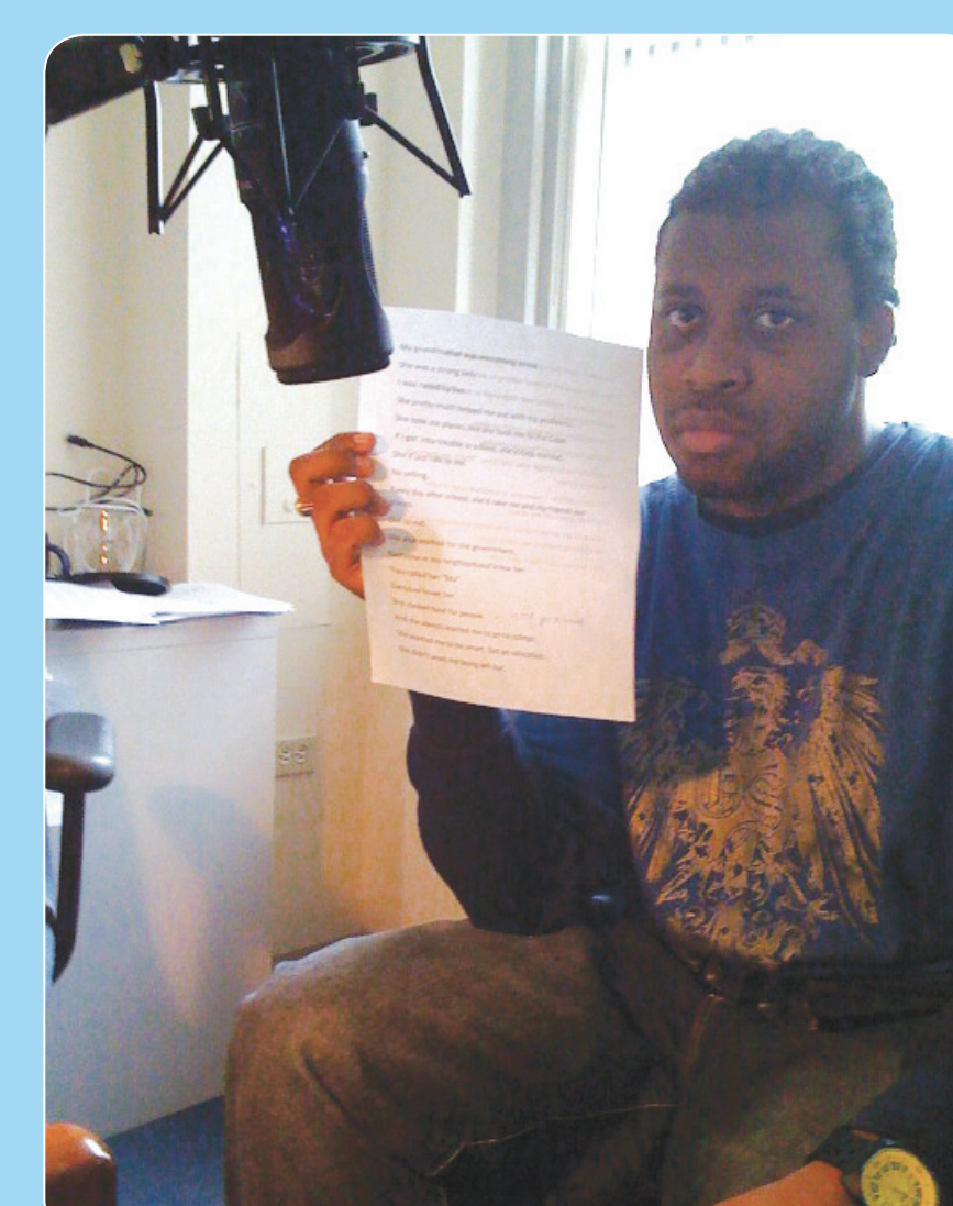
Students create videos about college