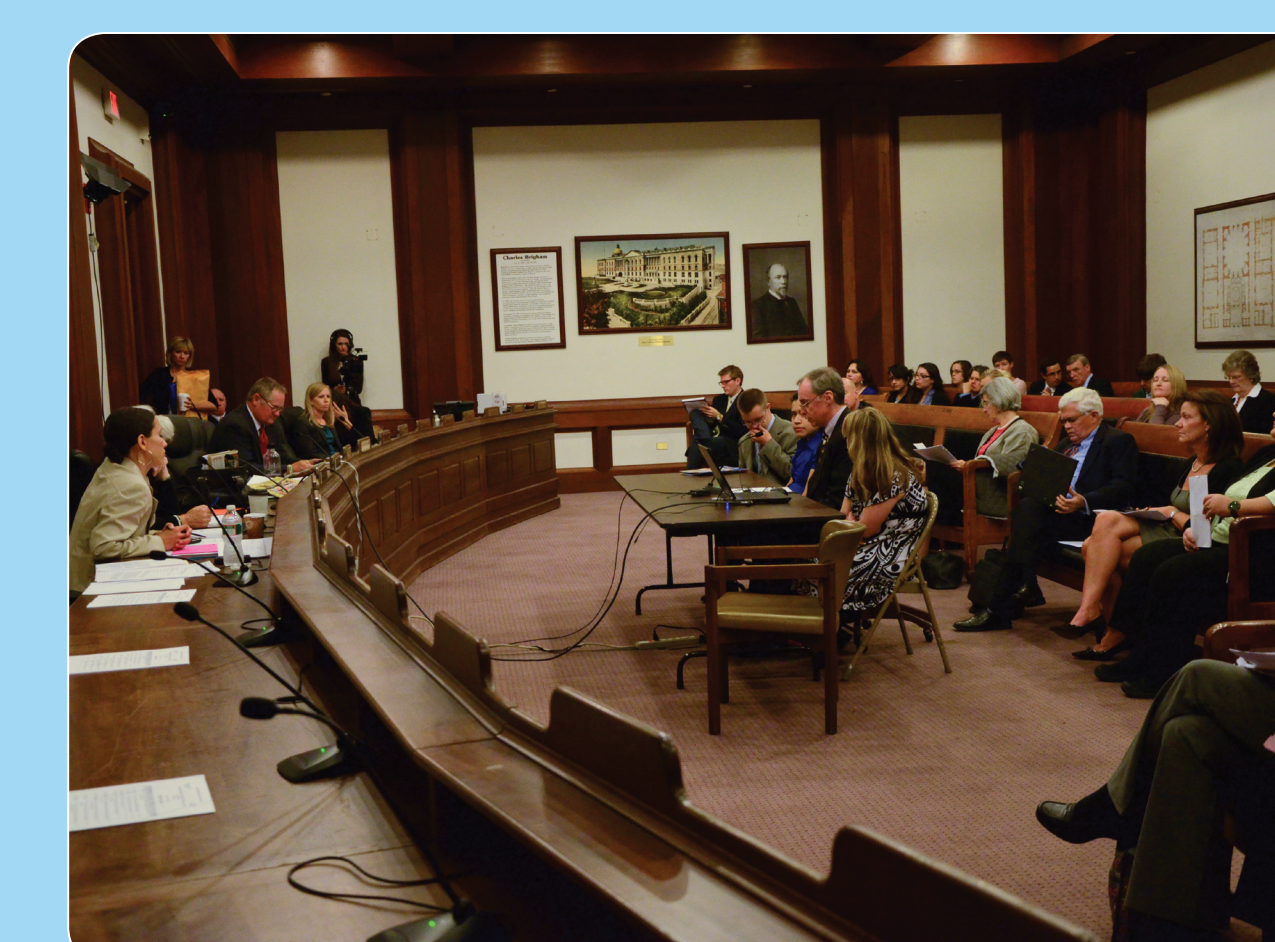
Students provide testimony to Massachusetts legislators in support of the Inclusive Concurrent Enrollment initiative