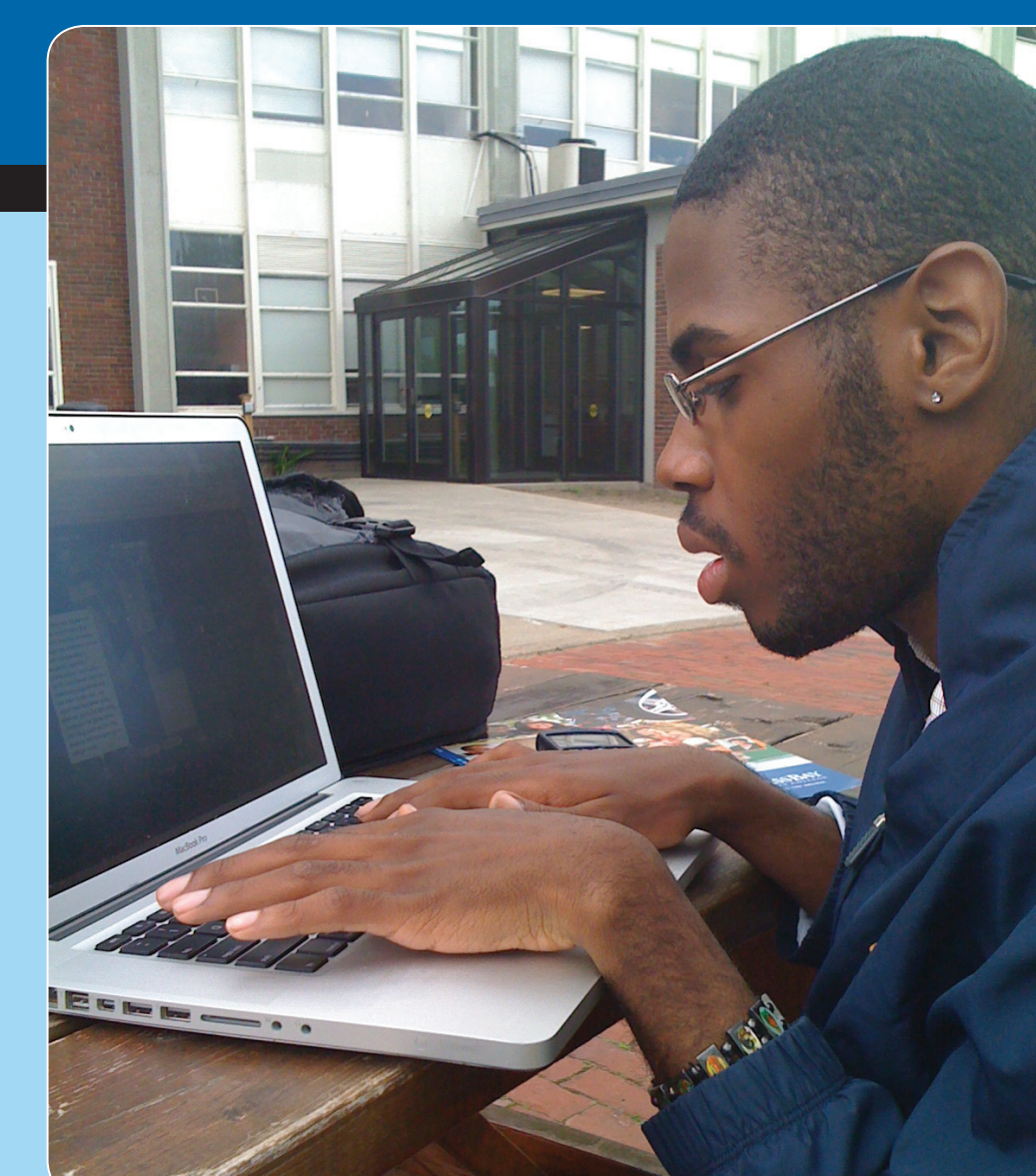
Student participation in Participatory Action Research for Think College