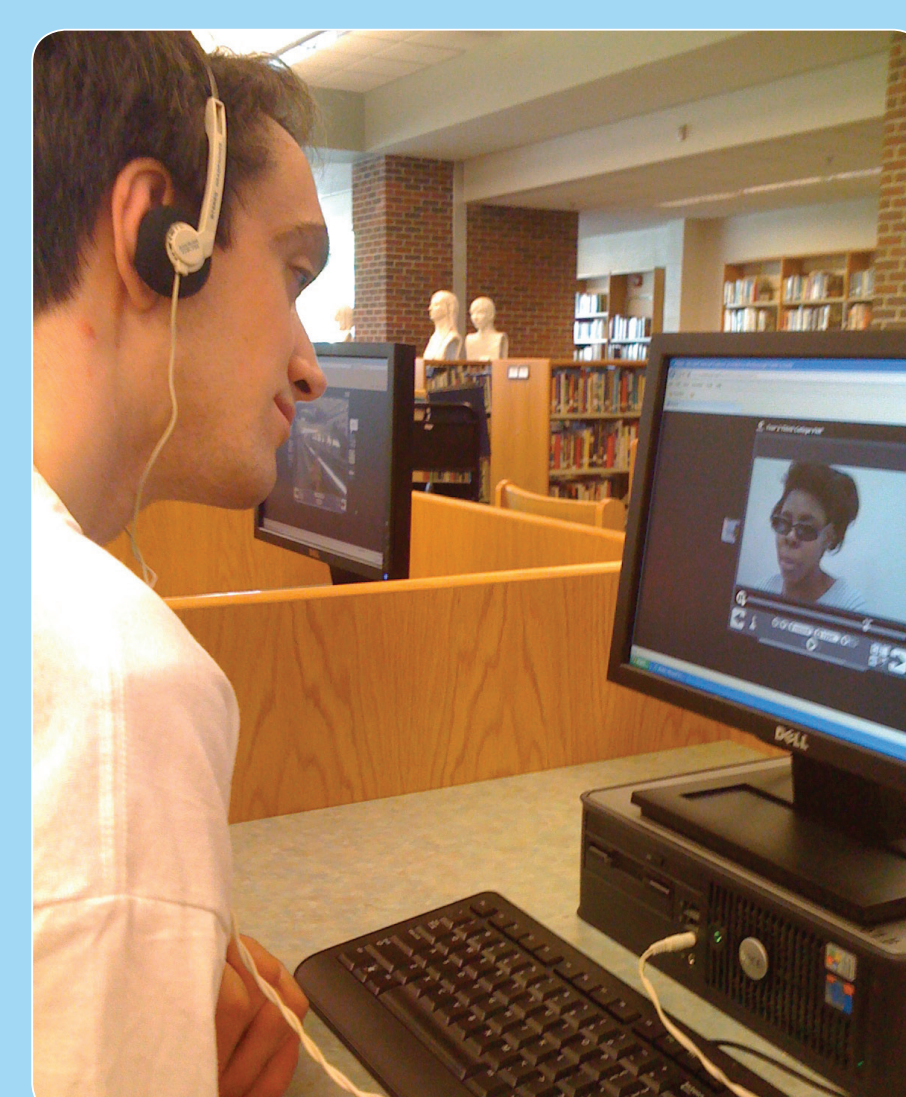
College students with ID compare notes with each other about their college experiences