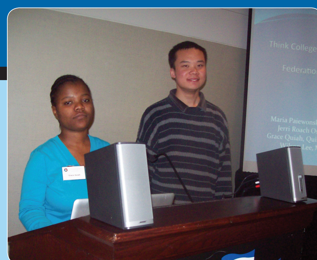
Students present at state and local conferences about the impact college is having on their lives

The Consortium for Postsecondary Education for Individuals with Developmental Disabilities is committed to engaging students with IDD in all inclusive research, training and technical assistance, and dissemination activities. Fulfilling this commitment has meant exploring accessible formats and appropriate content with and for students with IDD so they can actively participate in Think College research, website development, writing, discussions and advocacy.