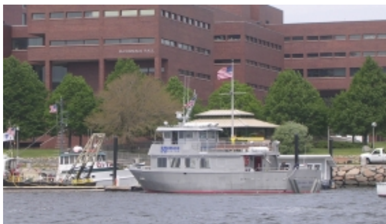
The M/V Columbia Point provides environmentally friendly transportation for education and research projects in and around the Boston Harbor Islands, as well as a new venue for social activities.