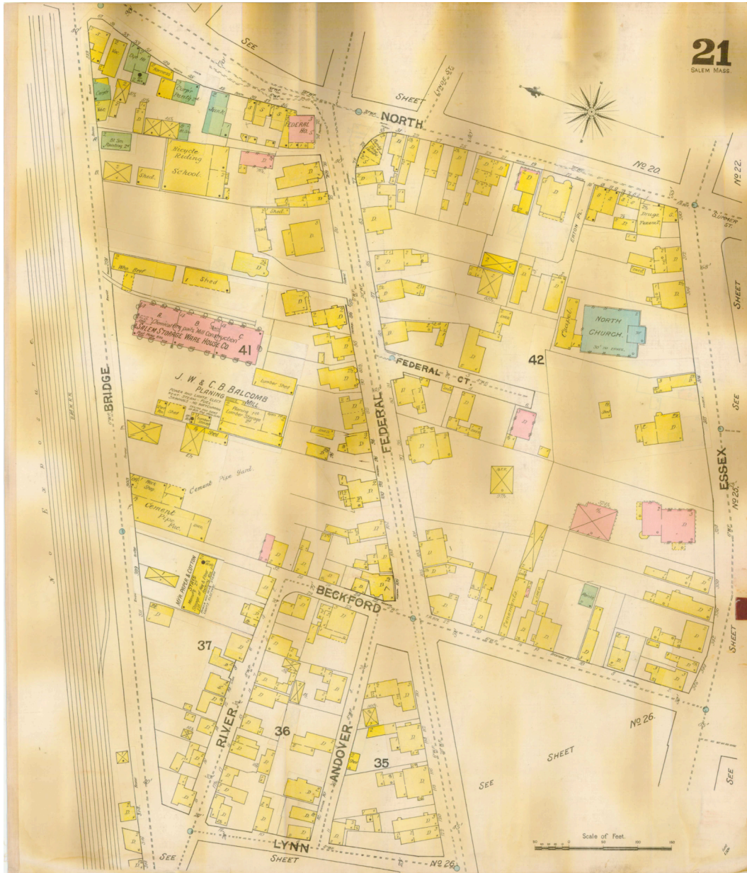
Map 8: Essex Street (The Ropes Mansion)