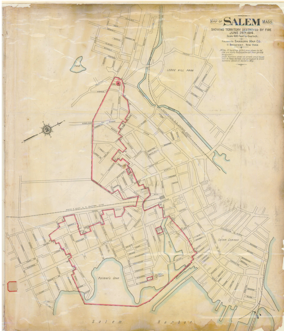
Map 9: Neighborhoods Destroyed by 1914 Fire