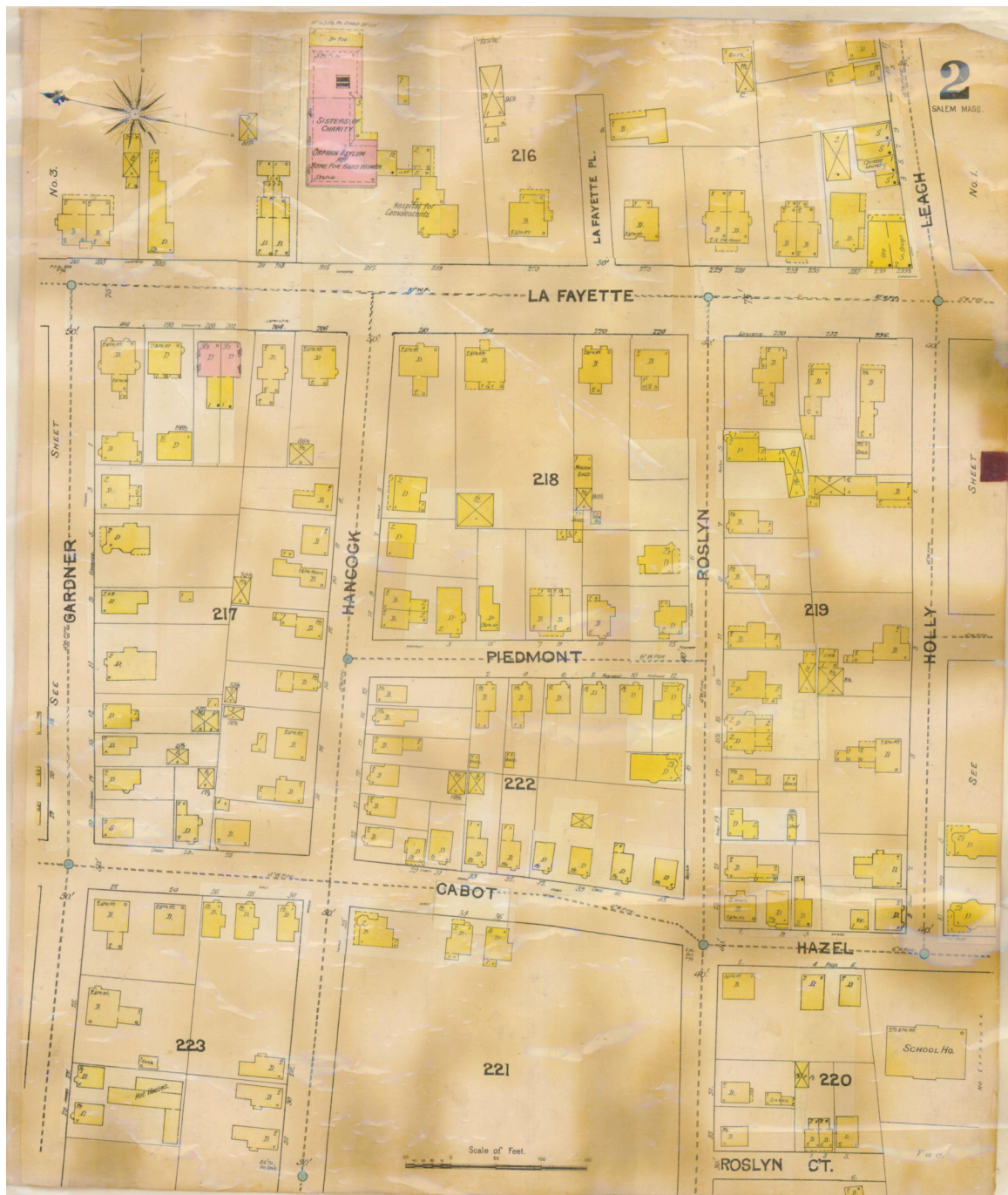
Map 6: Piedmont Street (The Smith Family)