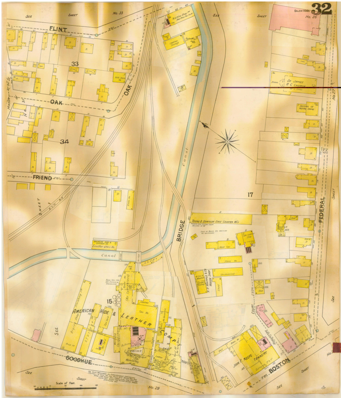
Map 4: Leather District or "Blubber Hollow"