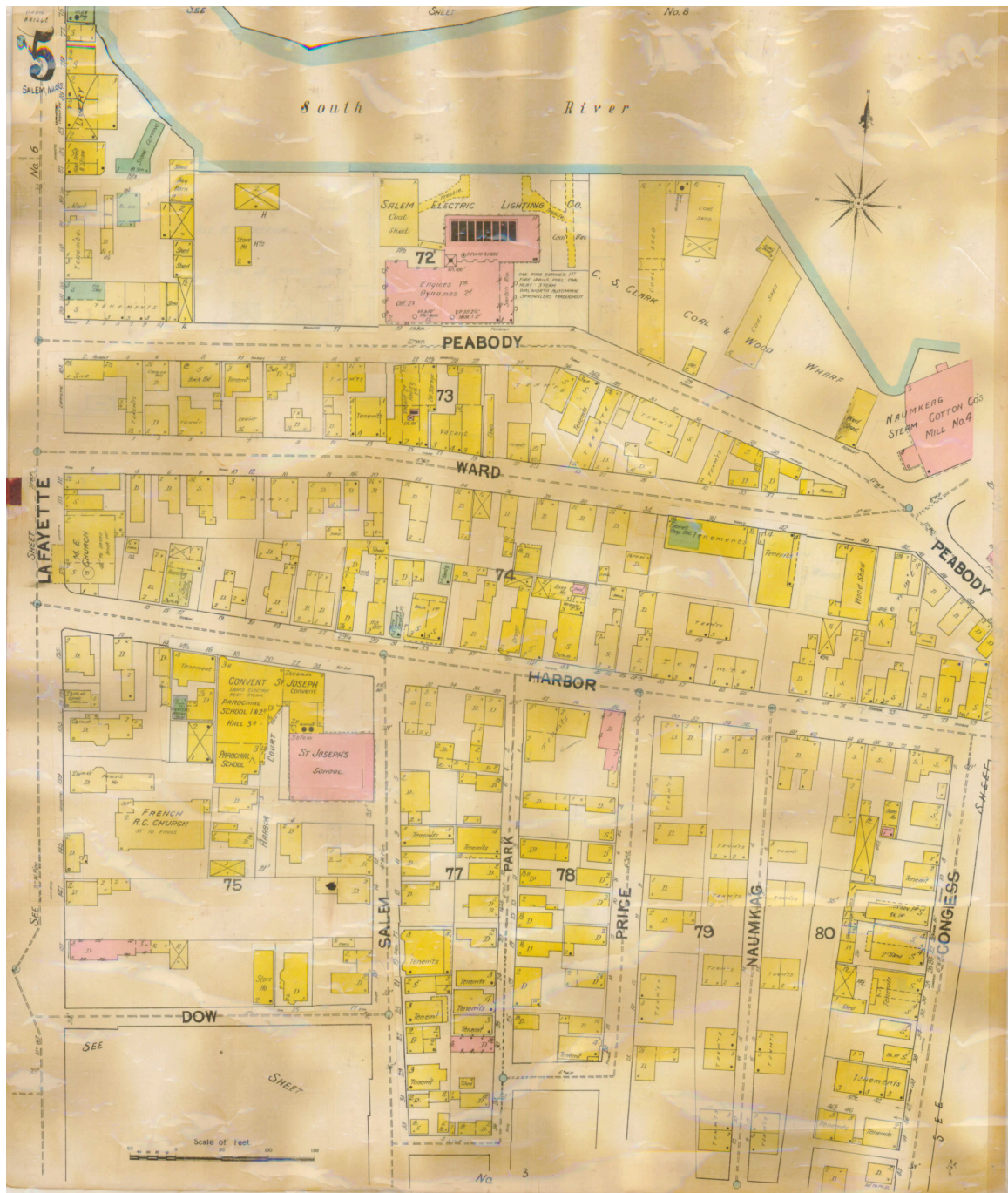
Map 2: Naumkeag Cotton Mill and "Point" Area