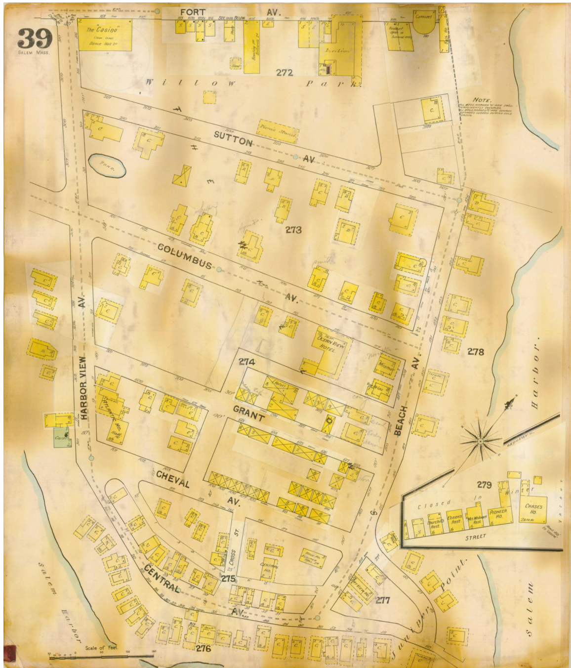
Map 5: Salem Willows Amusement Park