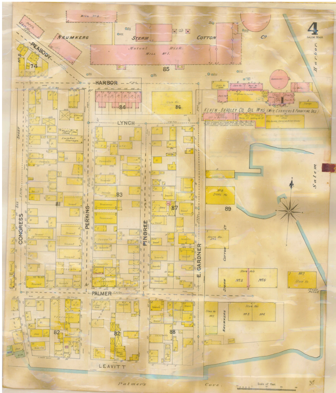
Map 3: Naumkeag Cotton Mill and Nearby Tenement Housing