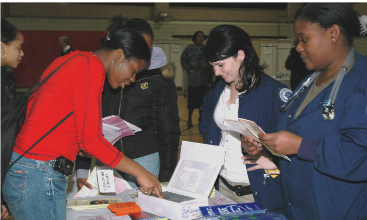
UMass Boston College of Nursing and Health Science Students advise students at a recent Dorchester Education Complex health fair.

“This designation is a tribute to the public service commitment that infuses our teaching, research