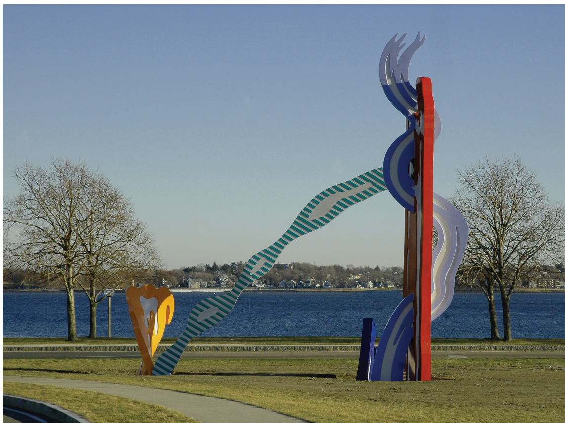
Roy Lichtenstein’s Brushstroke Group, a major new addition to the university’s public sculpture park Arts on the Point, adorns the landscape adjacent to the Campus Center.

“The sculpture is painted with the most expensive paint you can