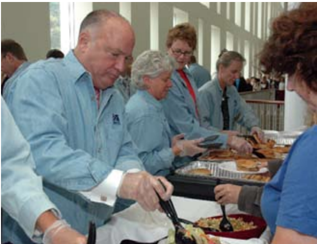
Faculty and staff donned denim shirts to serve up barbecue during the first week of school.