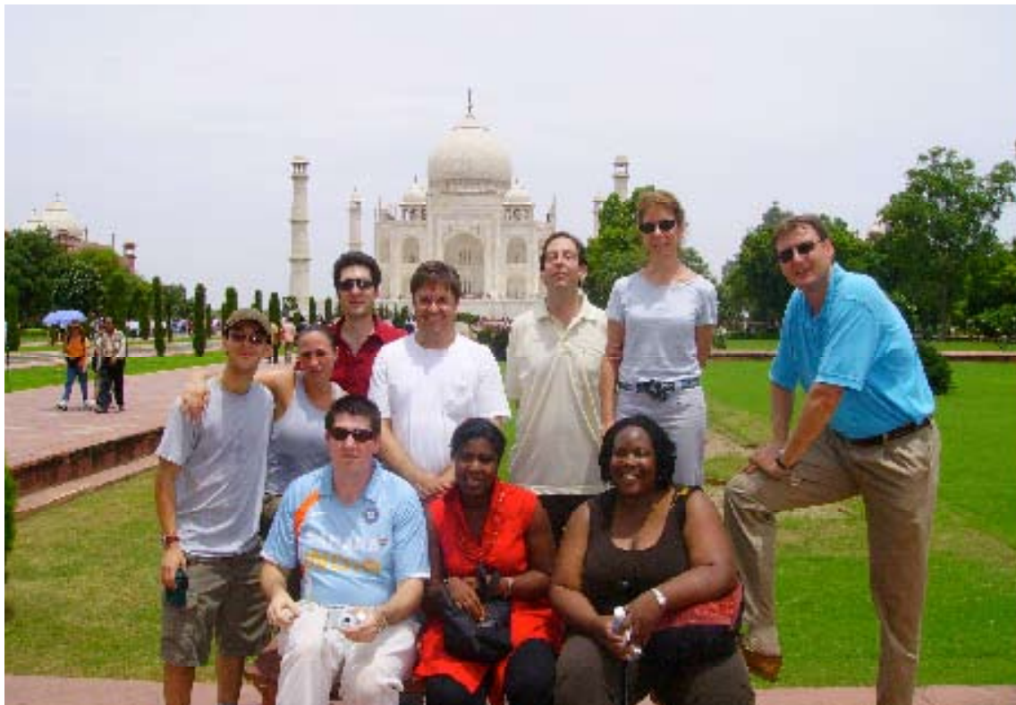
CM graduate students capped off their trip to India with a visit to the Taj Mahal.