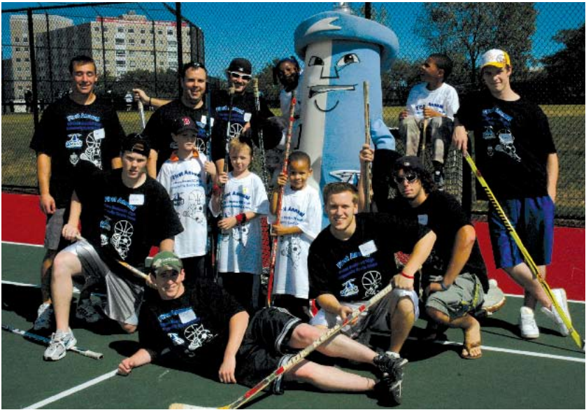
The Beacon paid a visit to the first annual UMass Boston/BC High Community Sports Outreach Clinic.