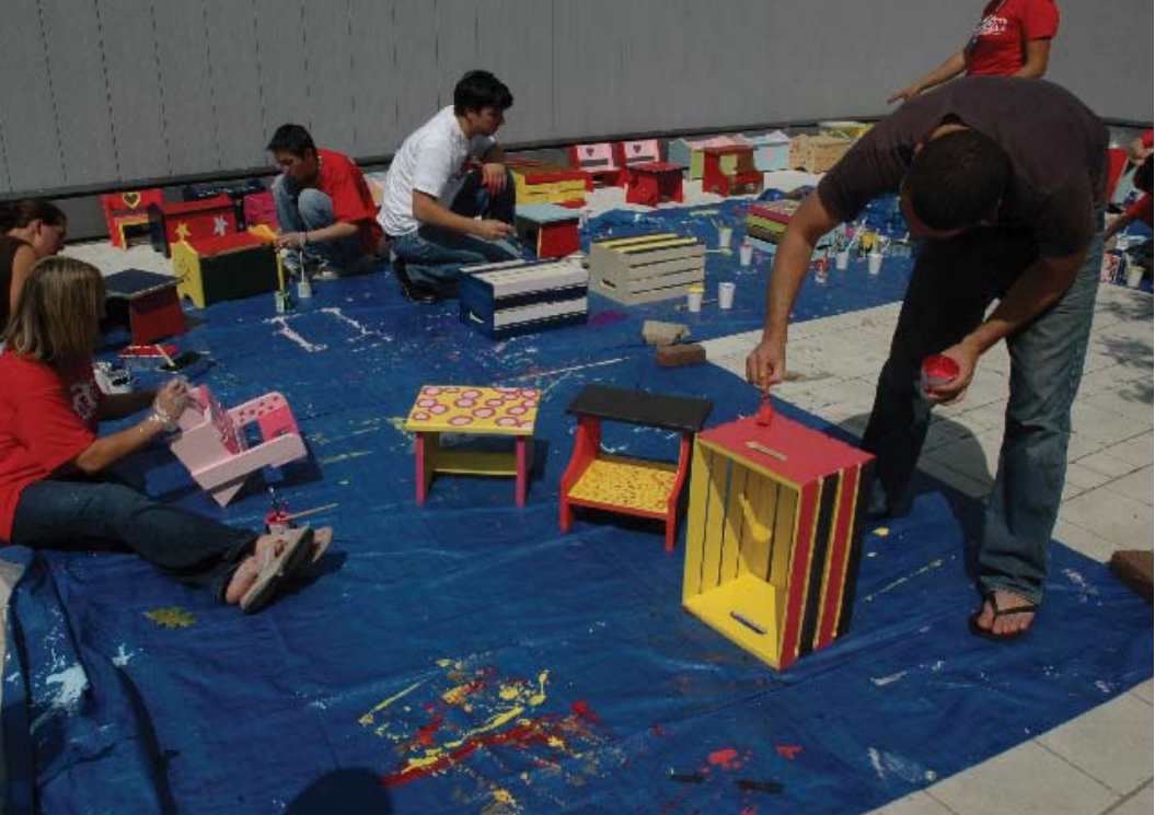
Students pitched in on Good Neighbor Day.