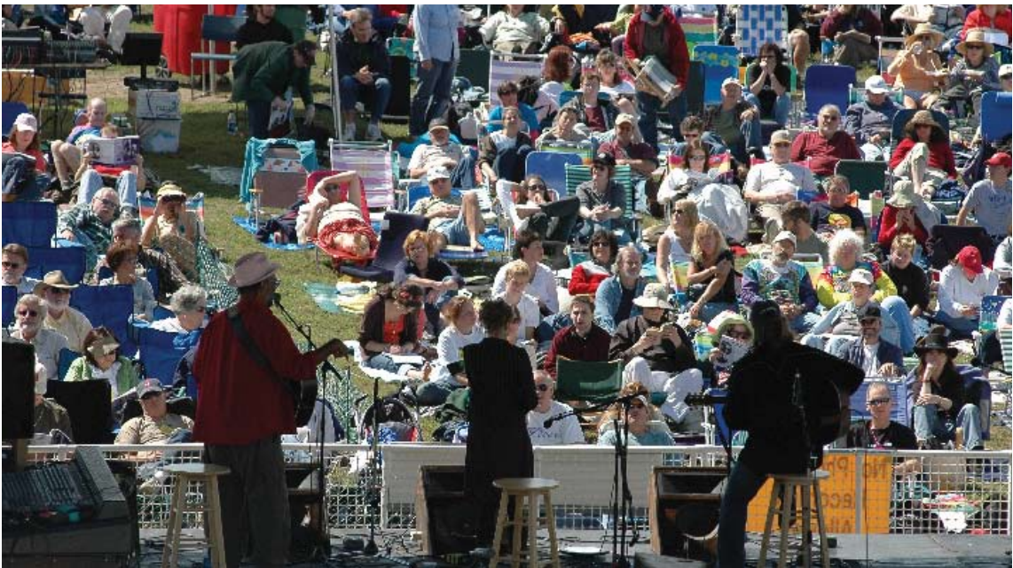
The field in front of the outdoor stage was packed at the 2007 Boston Folk Festival.