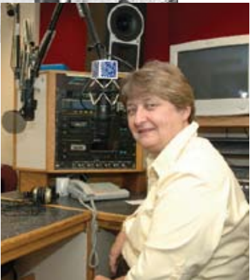
and now.