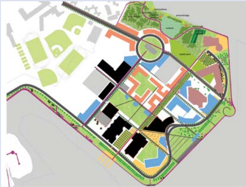
"Improve Connections" This model features multiple walkways better connecting the waterfront to the campus and surrounding community. The version of the North Park shown here includes an amphitheater and fountain.