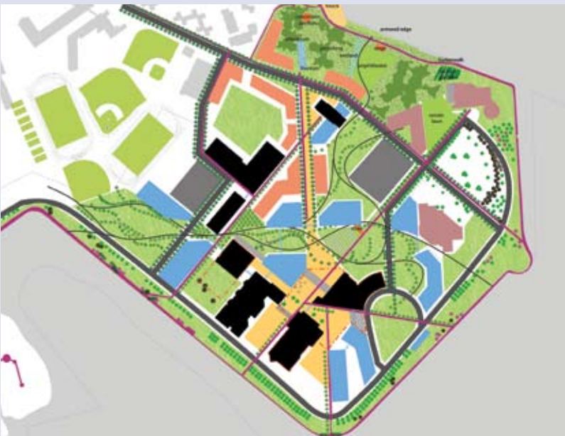
"Expand the Hub" This plan envisions a campus that extends the "hub" of the Campus Center and enhances the focus of activity around the building. Again, original buildings appear in black, proposed new buildings in peach and blue, and parking structures in gray. Here, the North Park has a different design, with open-air pavilions, gardens, wetlands, and a picnic area.