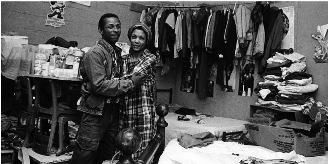
Man and woman in room at The Carpenter’s Shelter , Alexandria, Virginia.