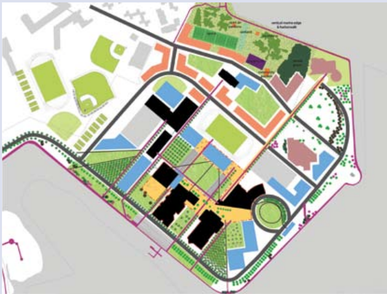
"Reinforce the Core" Here, the existing organization of buildings is the focal point. Campus buildings currently in use appear in black and proposed buildings are in blue and peach. New parking structures are shown in gray. A North Park area for informal recreation includes tennis courts, a playground, and a picnic area.