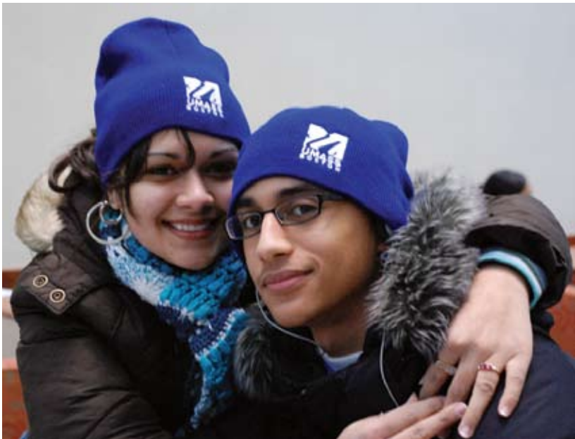
During the kickoff of Winter Blast, students, staff, and faculty enjoyed coffee and snacks, and modeled their always-fashionable UMass Boston ski hats.