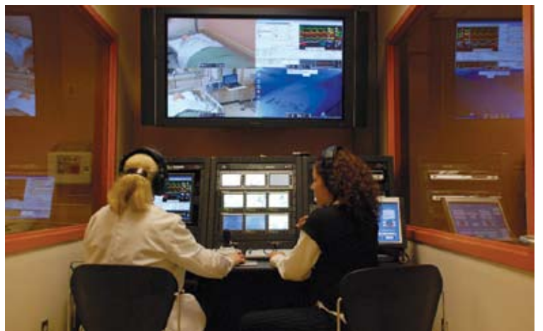
Scenes from the CCER: High-tech dummies, hands-on training, and high-definition monitoring.