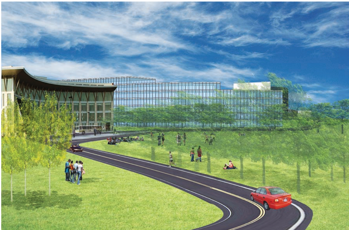
The first new academic building will be adjacent to the Campus Center; both will be served by a reconfigured roadway.

Nearly coinciding with the funding approval was the selection of the Boston architectural firm Goody Clancy to conduct a programming study and preliminary design for the campus’s first new academic building in some 35 years, an Integrated Sciences Complex. The new building,