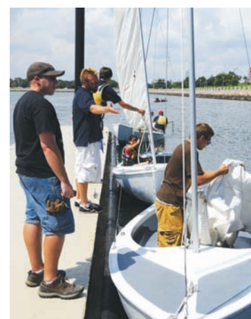
Left to right: An instructor leads two new sailors down the dock; the new pumpout boat; getting ready to set sail.