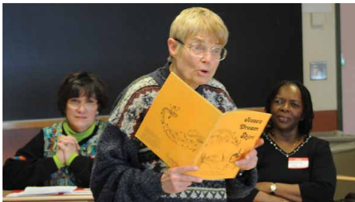
Role reversal: At the conference, teachers were the students.