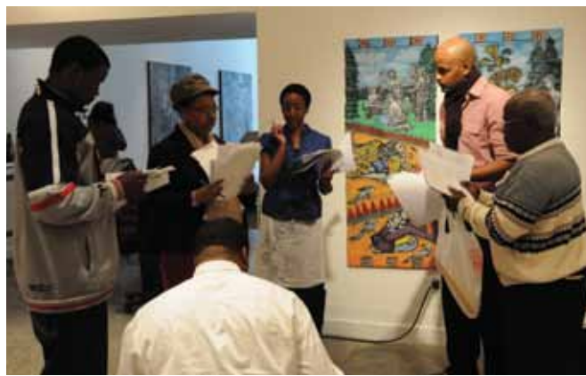
Left: Rehearsal at the Harbor Gallery for staged reading of two black theater classics, Raisin in the Sun by Lorraine Hansberry and Radio Golf by August Wilson.