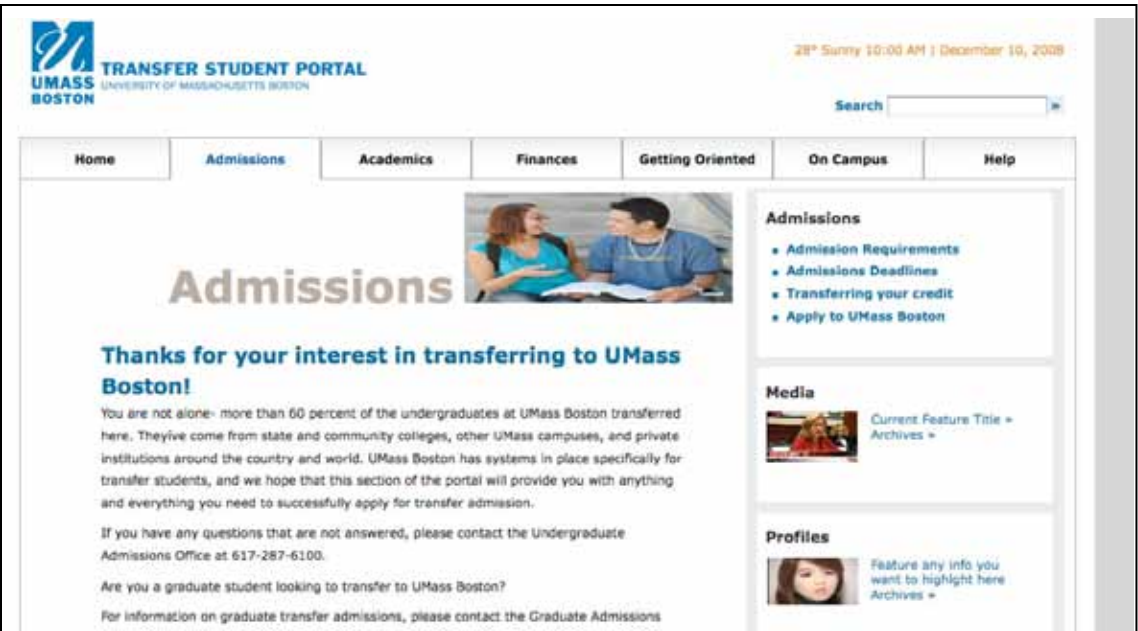
The new Web portal streamlines everything from learning about the campus to finding out how to transfer credits.

ing articulation agreements with our community college partners, the electronic transfer of transcripts and evaluation of credit, and implementation of a prospective student planning tool called u.select.”