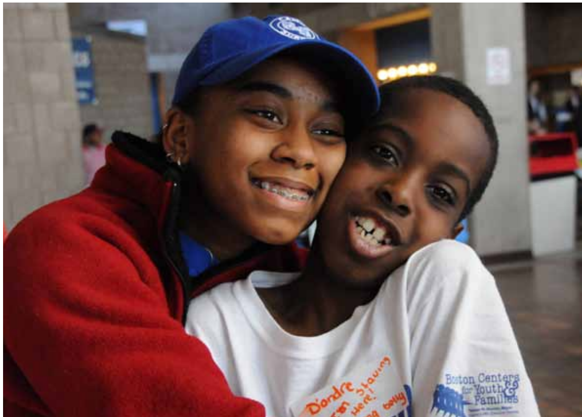
Just one of the many happy reunions at the Camp Shriver Reunion.

What sets Camp Shriver apart from other recreational opportunities is its unique commitment to creating an inclusive, sports-oriented day camp experience at no cost, in which children with and without intellectual disabilities play and learn together. Campers are provided transportation to and from camp, breakfast and lunch, and camp gear. While at camp, children receive instruction in a variety