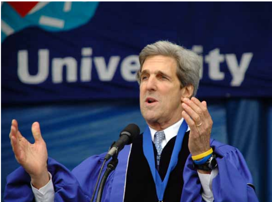
U.S. Senator John Kerry.

"Together, we are part of this country's grand march forward to its grand ideals—to make good on this improbable idea called America," said Kerry, who later reminded graduates, "Each new