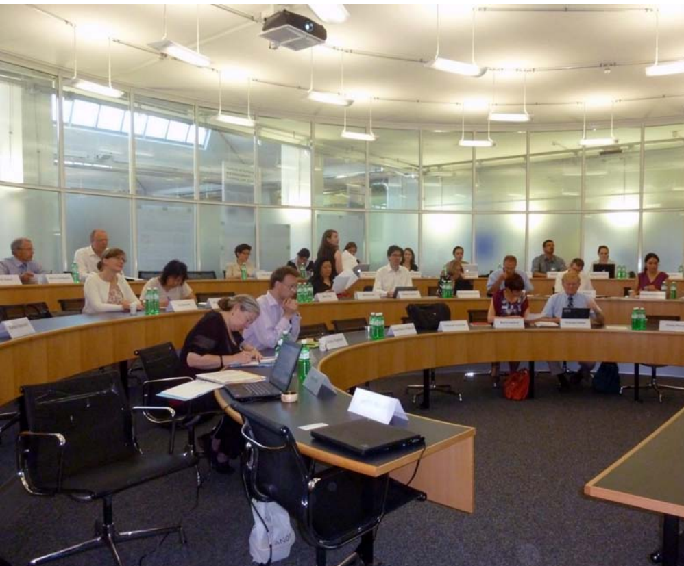
Bern workshop participants engage in plenary discussions

“Continuous engagement of government officials and academics in a dialogue that furthers the analysis, allowing for ‘free space’ for thinking and conversing, will be an important enabling condition for reform.”