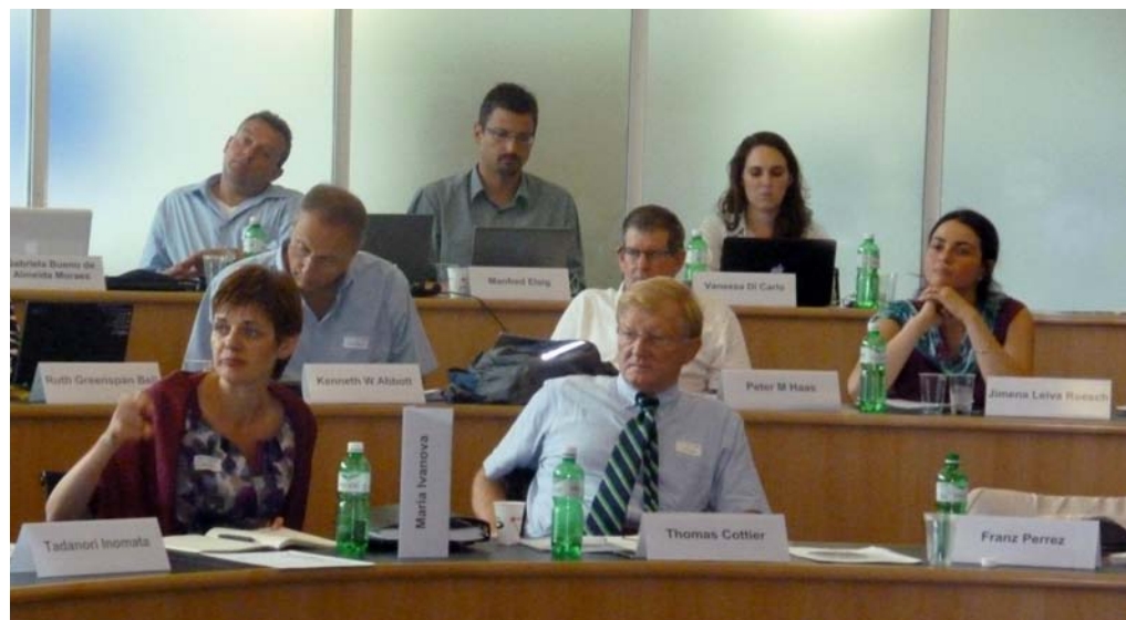
Participants engage in plenary discussions

“Streamlining existing institutions allows for keeping all other options open since it does not prescribe a particular institutional arrangement.”