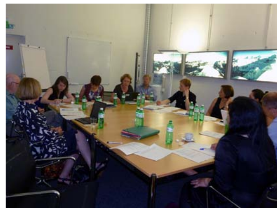
Participants discuss in small groups

“Moving to any of the proposed institutional reform options would present both benefits and risks, and alternatives should be assessed accordingly.”