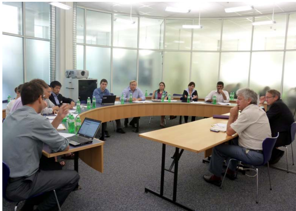
Participants discuss in small groups

Against this backdrop, participants examined the performance of the international environmental governance system and UNEP in particular as the anchor institution for the global environment and thought through reform options for the international environmental regime.