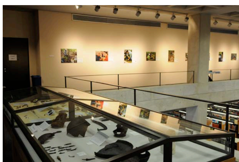
[Photos: (top) Tribal community members, INENAS Director, Professors; (bottom) Artifacts from Eastern Pequot Field School, in background.]