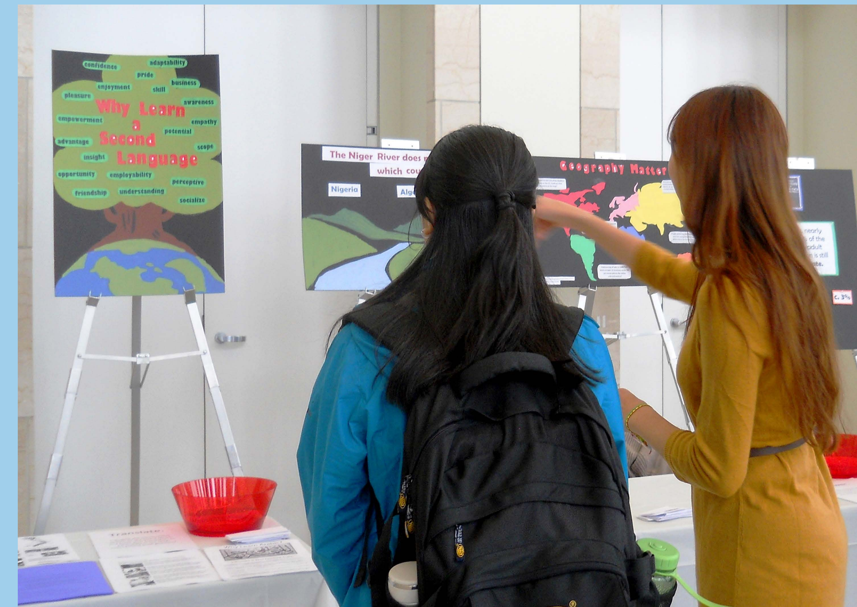
Above: UMass Boston students discuss presentations given during International Education Week; Left: UMass Boston students explore Boston during the Ethnic Enclaves of Boston Walking Tour.