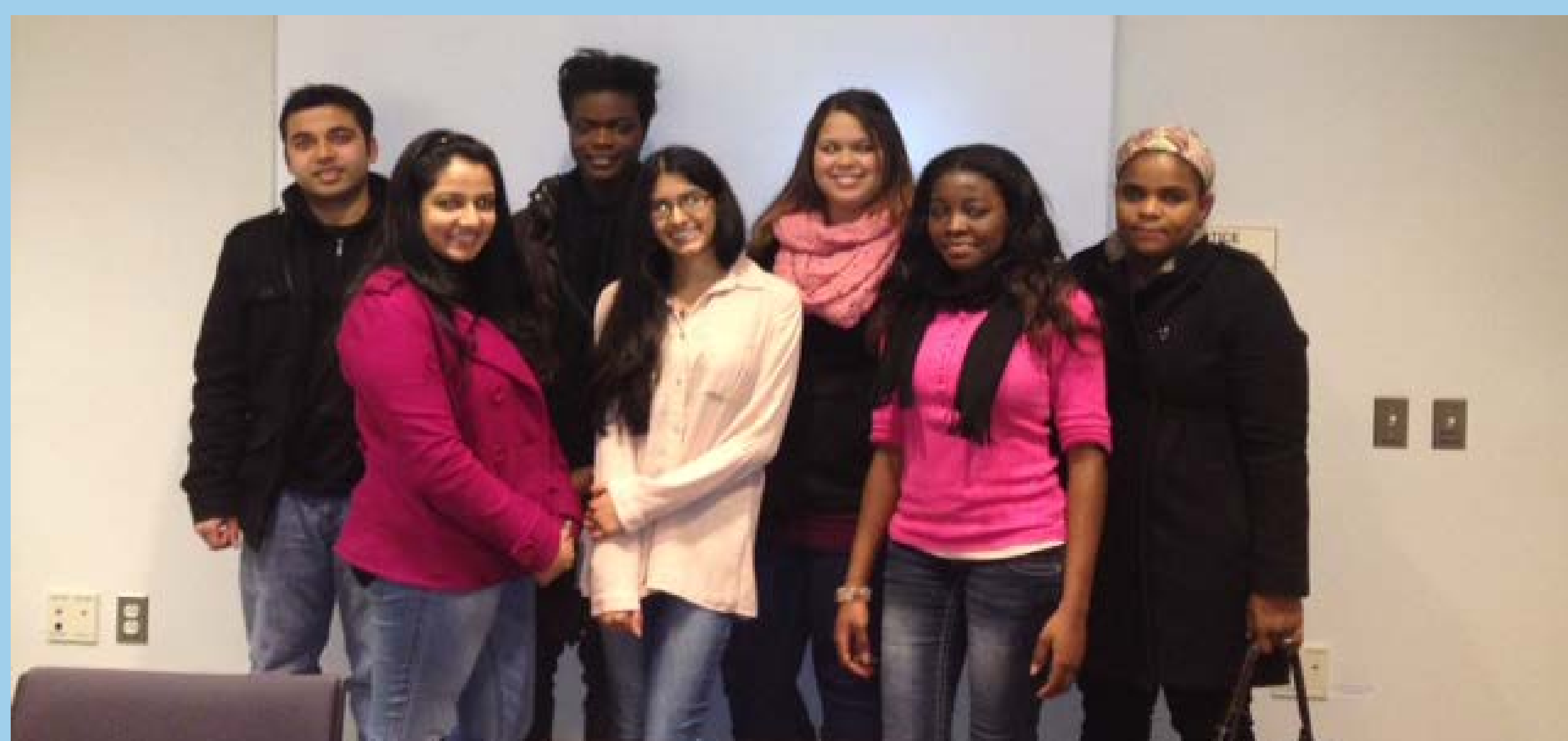
CESI Ambassadors, undergraduate students who are supporting program activities and faculty projects.

The Civic Engagement Scholars Initiative (CESI) is a professional development program that supports faculty and community partners to effectively engage undergraduate students in service-learning and community-based research activities . CESI aims to reinforce classroom learning, foster civic habits and skills, and address community-identified needs.