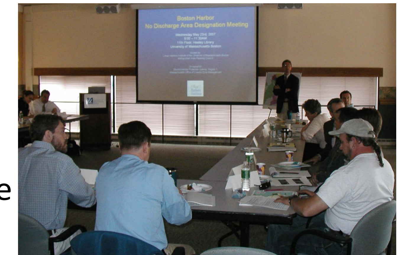
Harbor masters, scientists, and coastal managers meet to discuss the Boston Harbor No Discharge Area designation