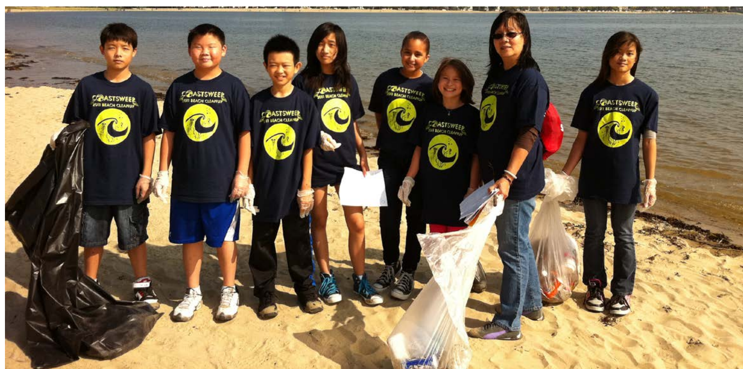
Students from the Josiah Quincy School participate in a COASTSWEEP event

Many of UHI's projects and activities either directly or indirectly contribute to enhanced public education about the marine environment.