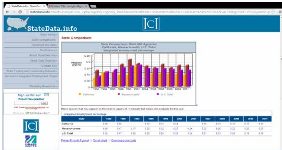
Figure 6. Example IDD Agency Bar Chart