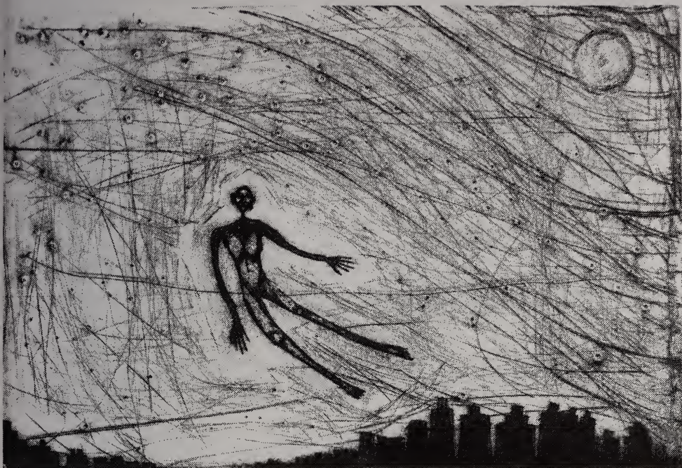
untitled #5 JENNIE MCCRACKEN