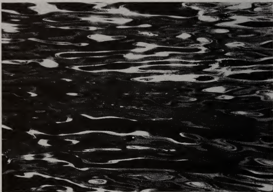
untitled HEIDI COPE