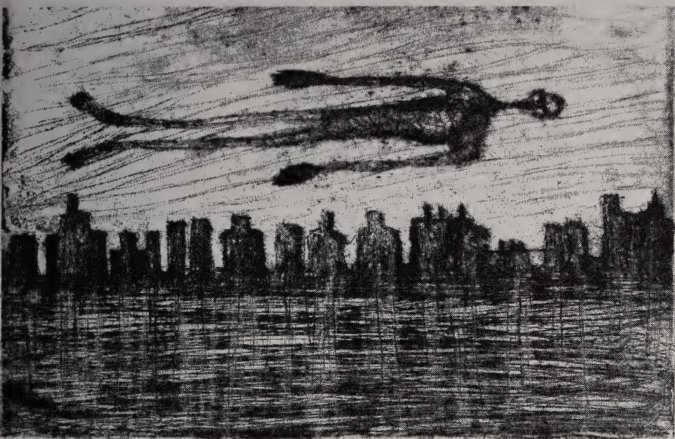
untitled #1 JENNIE MCCRACKEN