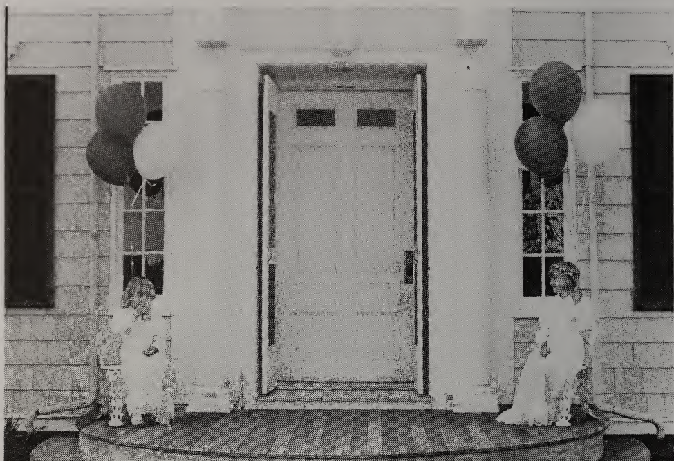
untitled KIRK GAGNIER