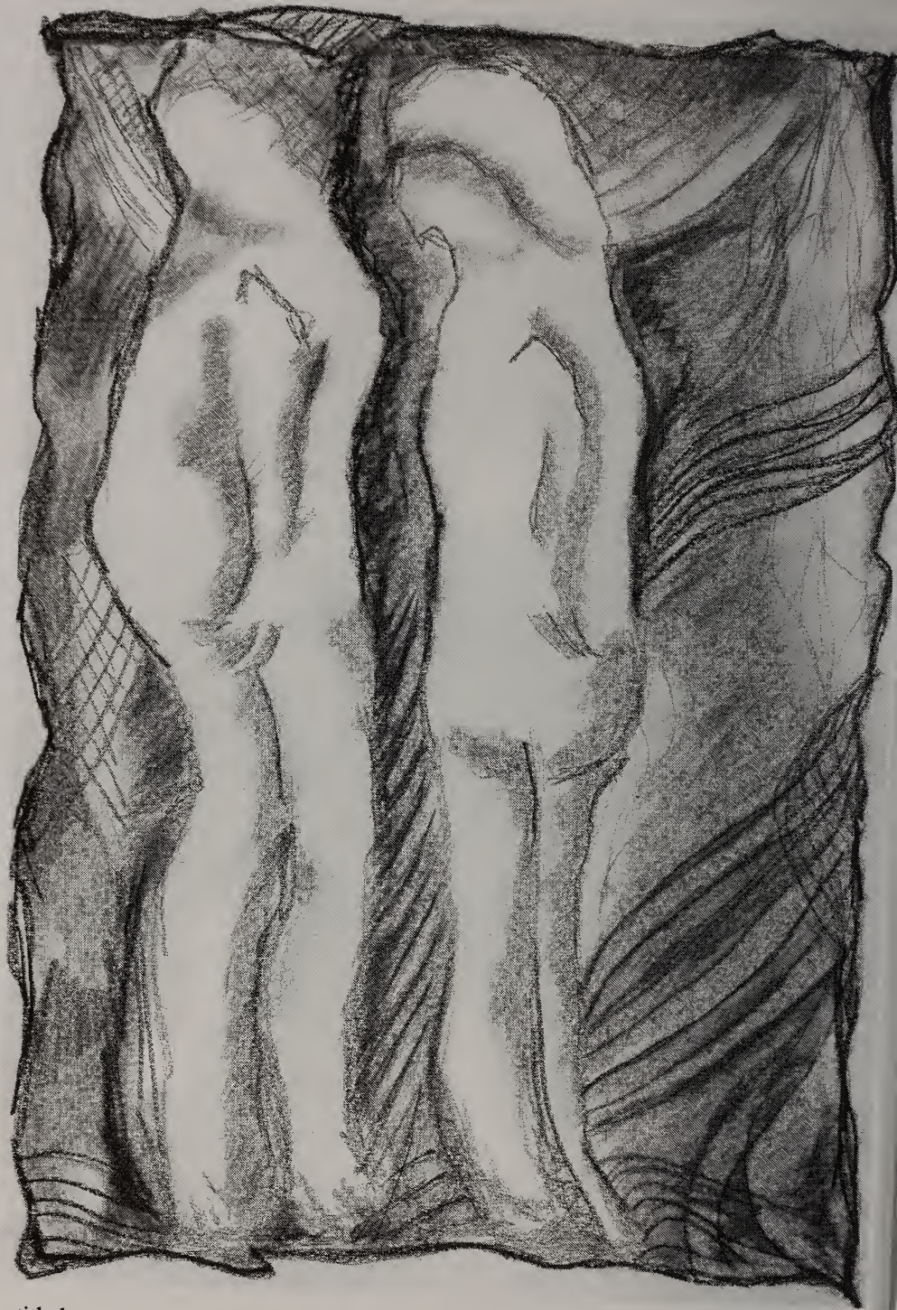
untitled KIM BABON