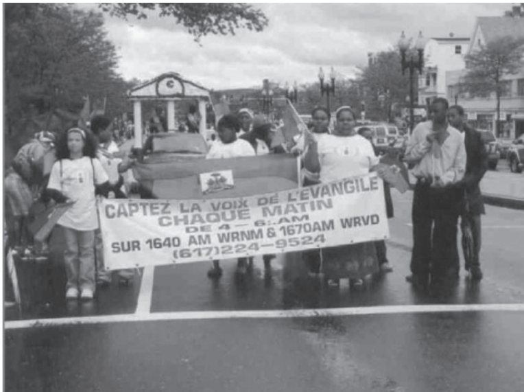
Haitian American Day Parade

Haitian Day Parade as another example of the ethnic schism that divides Mattapan and prevents better group collaborations. This is how one informant perceives the culturally specific carnivals, including the Haitian Day Parade: “I think that it is unfortunate. Every culture is going for itself. You know, we used to have, for example, a Caribbean festival. Now we have a Haitian festival, Jamaican festival, Cape Verdean festival, Dominican festival. Everybody is kind of going for themselves when before we were really one. Black people went to it, and everyone went to it. It’s kind of like we celebrate together. But now you have three or four going on, and I think it is a way to separate us.”