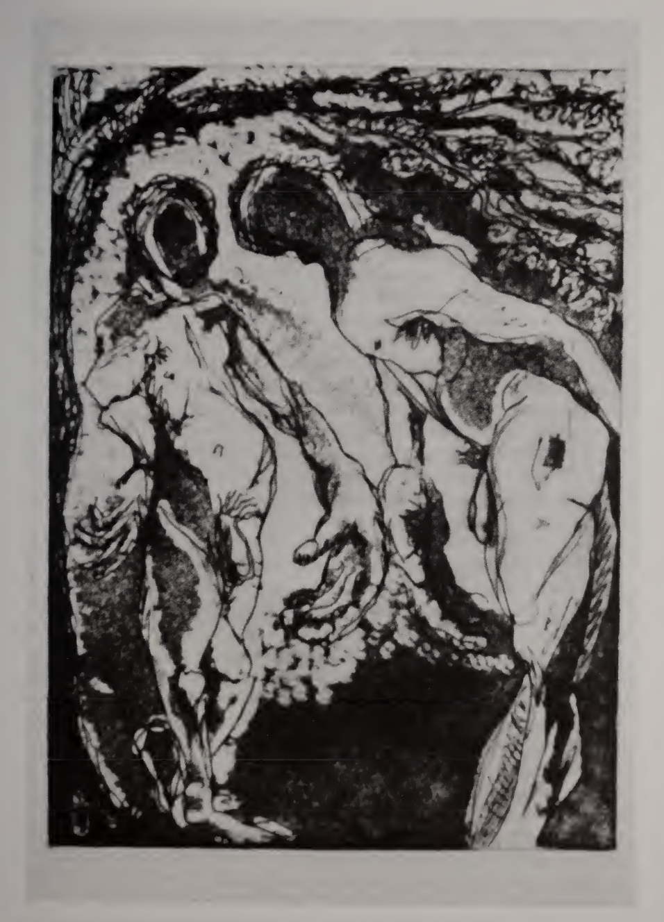
The Meeting (intaglio print, 1990)