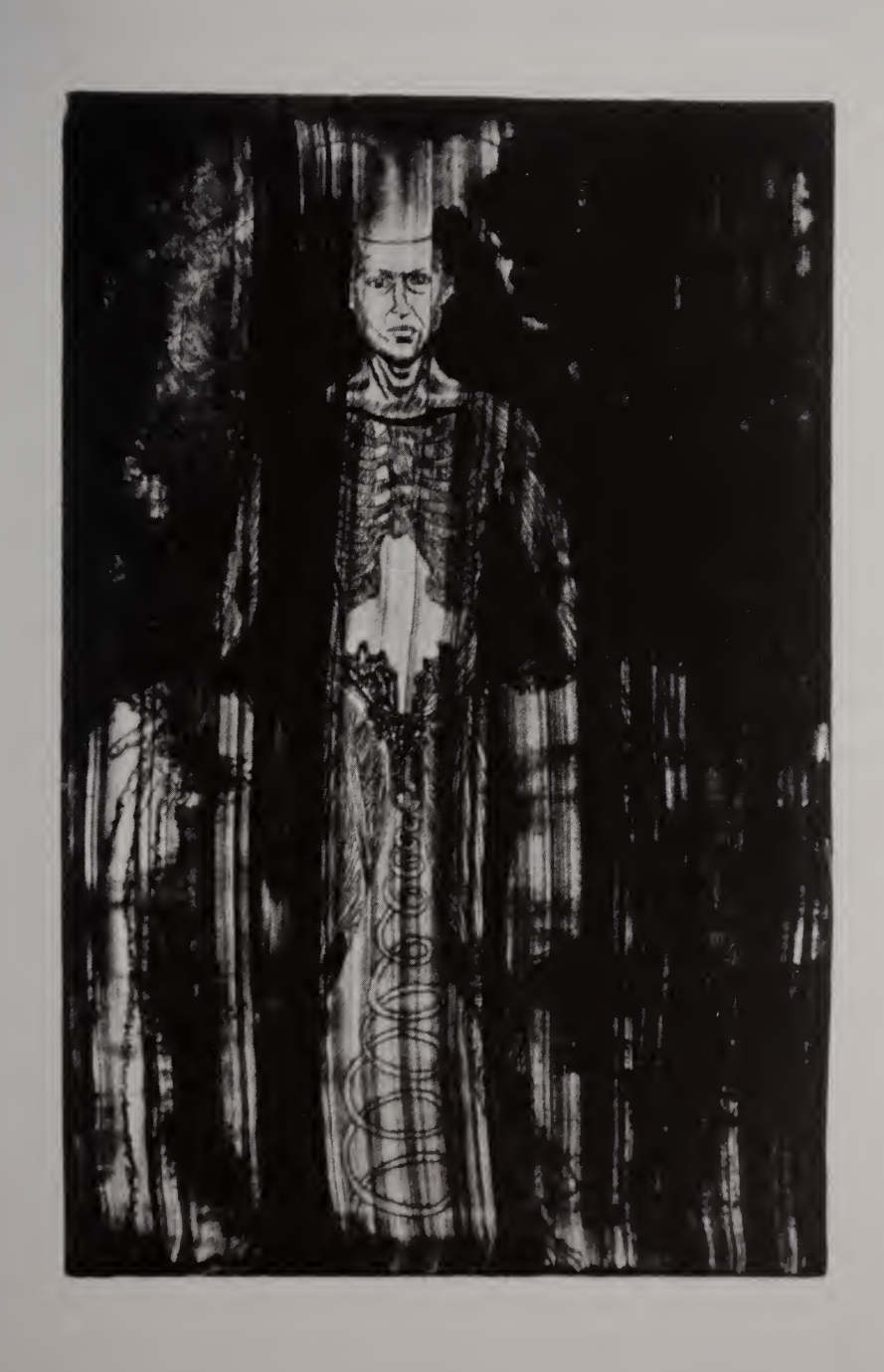
Getting Through (monoprint, 1990)