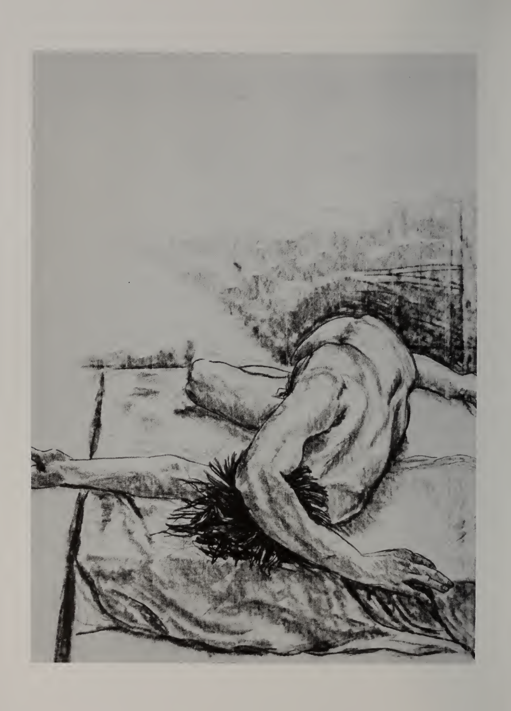
Study of Mathias (charcoal on grey paper, 1990)