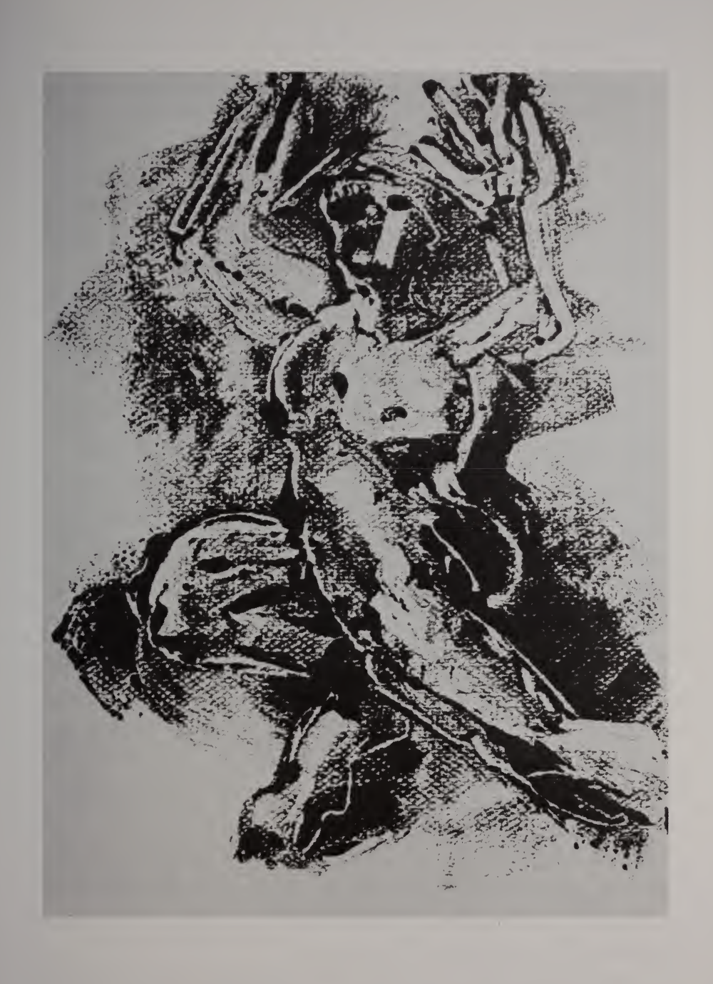
Springtime (monoprint, 1991)