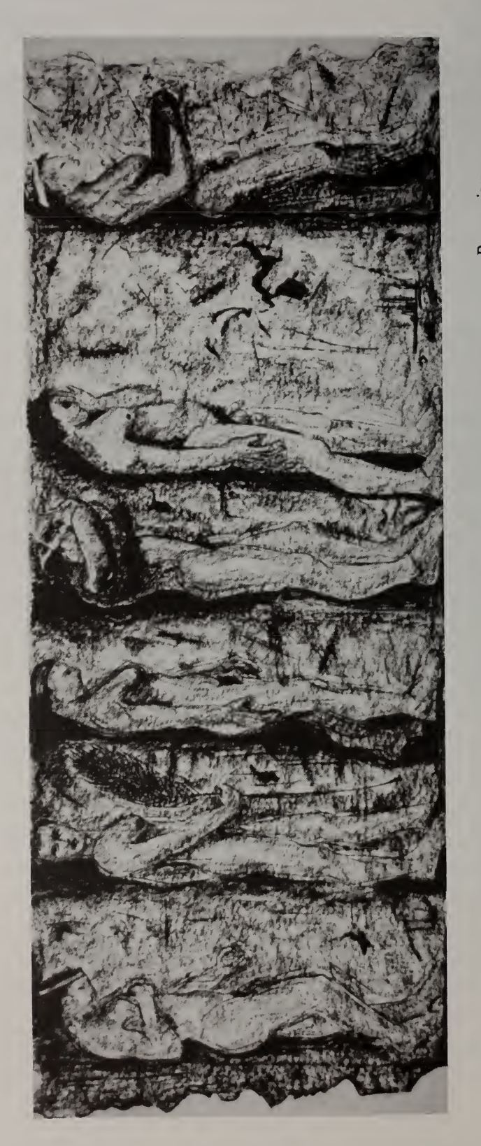
Procession (charcoal and pastel, 1990)