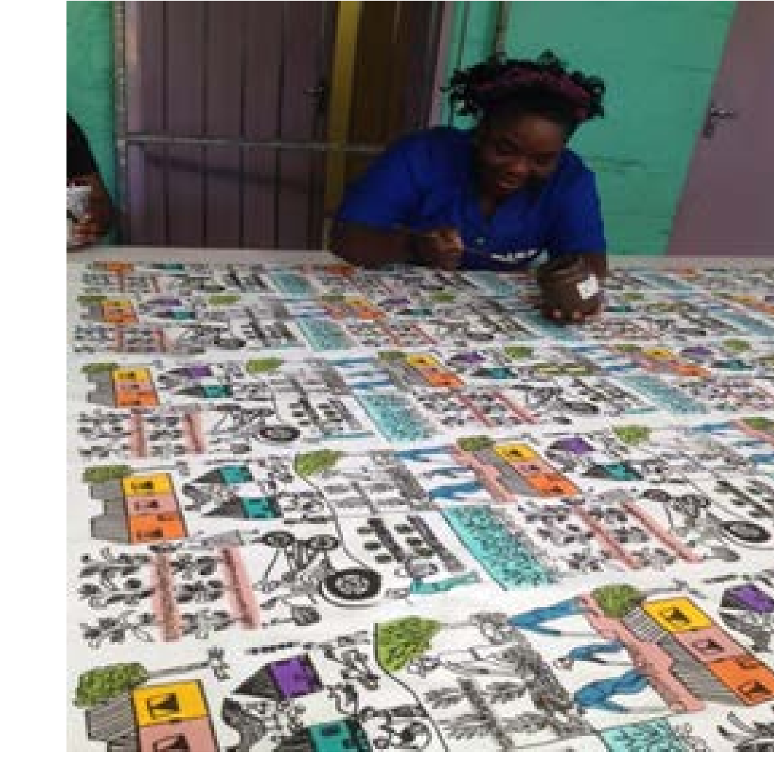
Philani Child Health & Nutrition Project