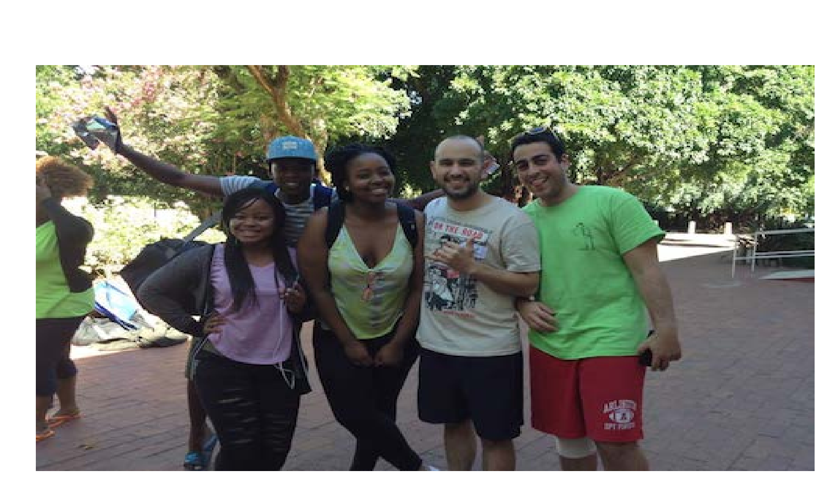
At the HIV/AIDS Peer Educators' Retreat with UWC Students

In Spring 2014, students are volunteering at Boston Living Center and Fenway Health.