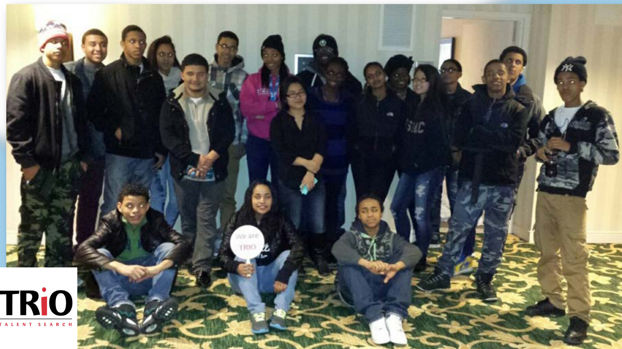
2014 TRIO Day Conference

Project REACH is a federally funded program. To learn more about the program, email projectreach@umb.edu or call 617.287.7390.