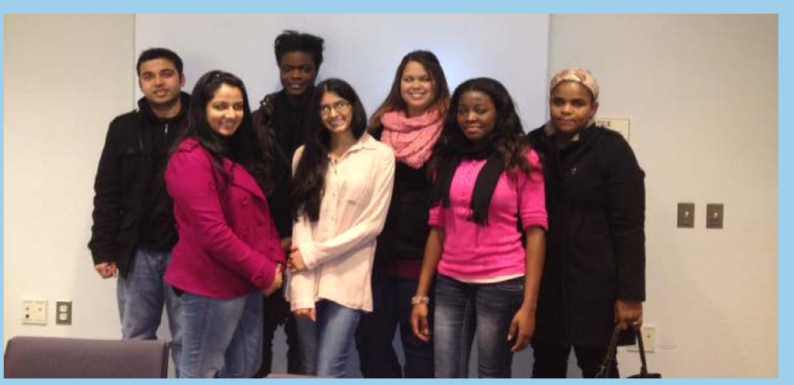
CESI Ambassadors, undergraduate students who are supporting program activities and faculty projects.

The Civic Engagement Scholars Initiative (CESI) is a professional development program that supports faculty and community partners to effectively engage undergraduate students in service-learning and community-based research activities. CESI aims to reinforce classroom learning, foster civic habits and skills, and address community-identified needs.