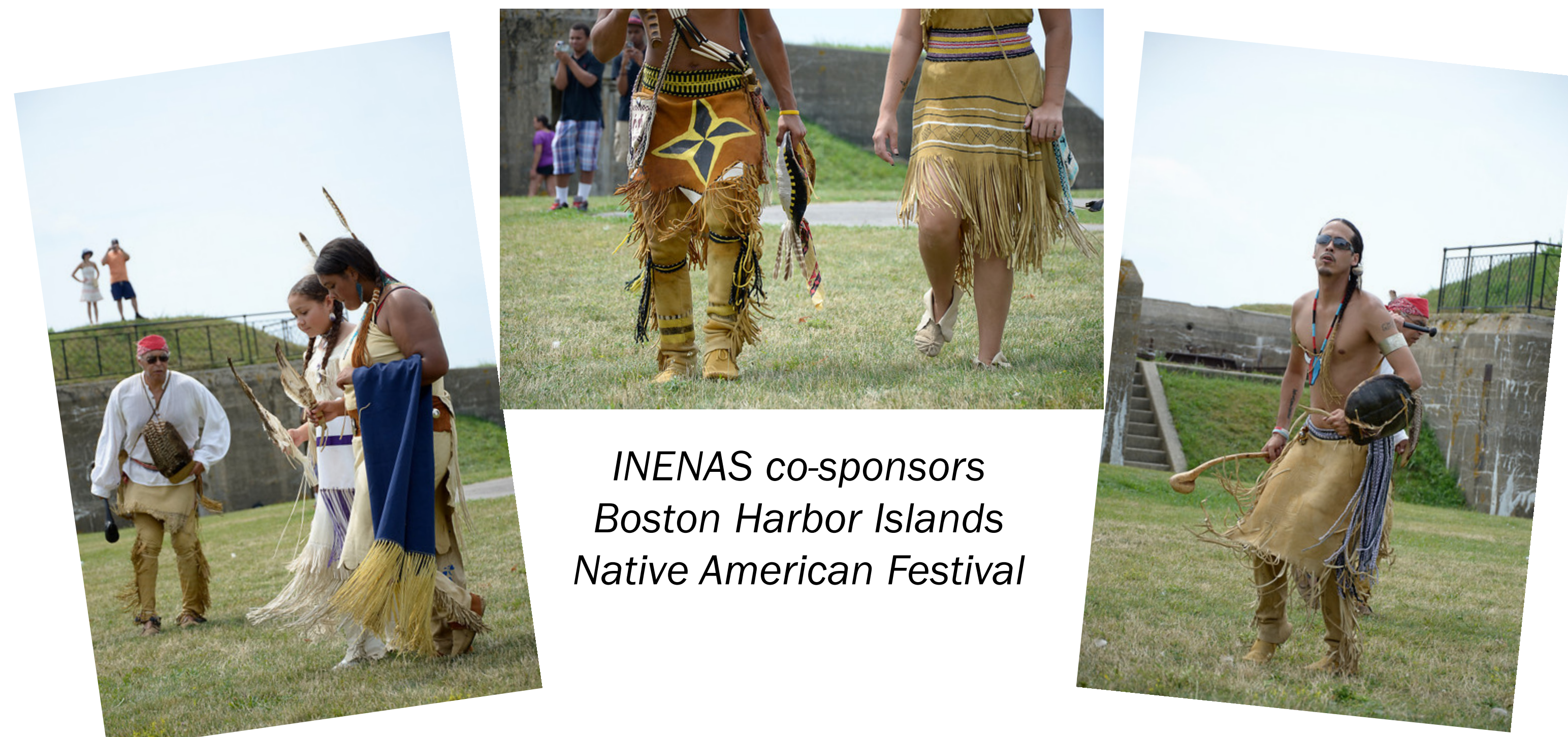
INENAS co-sponsors Boston Harbor Islands Native American Festival