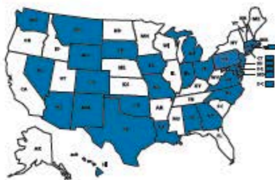
SELN Member States

A membership network of 29 states, the State Employment Leadership Network is a community of practice where members meet to connect, collaborate, and share information and lessons learned across state lines and system boundaries. Participating state agency officials build cross-community support for pressing employment-related issues and policies at state and federal levels. States commit to work together and engage in a series of activities to analyze key elements in their systems to improve the integrated employment outcomes for their citizens with intellectual and developmental disabilities.