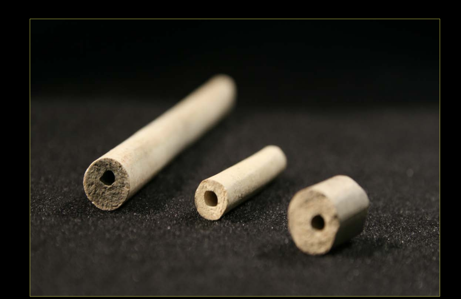
Smoking pipe fragments

Department of Anthropology and M.A. Program in Historical Archaeology Eastern Pequot Tribal Nation, North Stonington, Connecticut