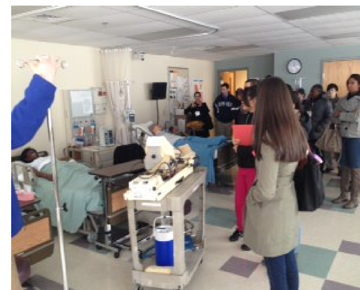
Students taking a tour of a medical science lab on a college tour.