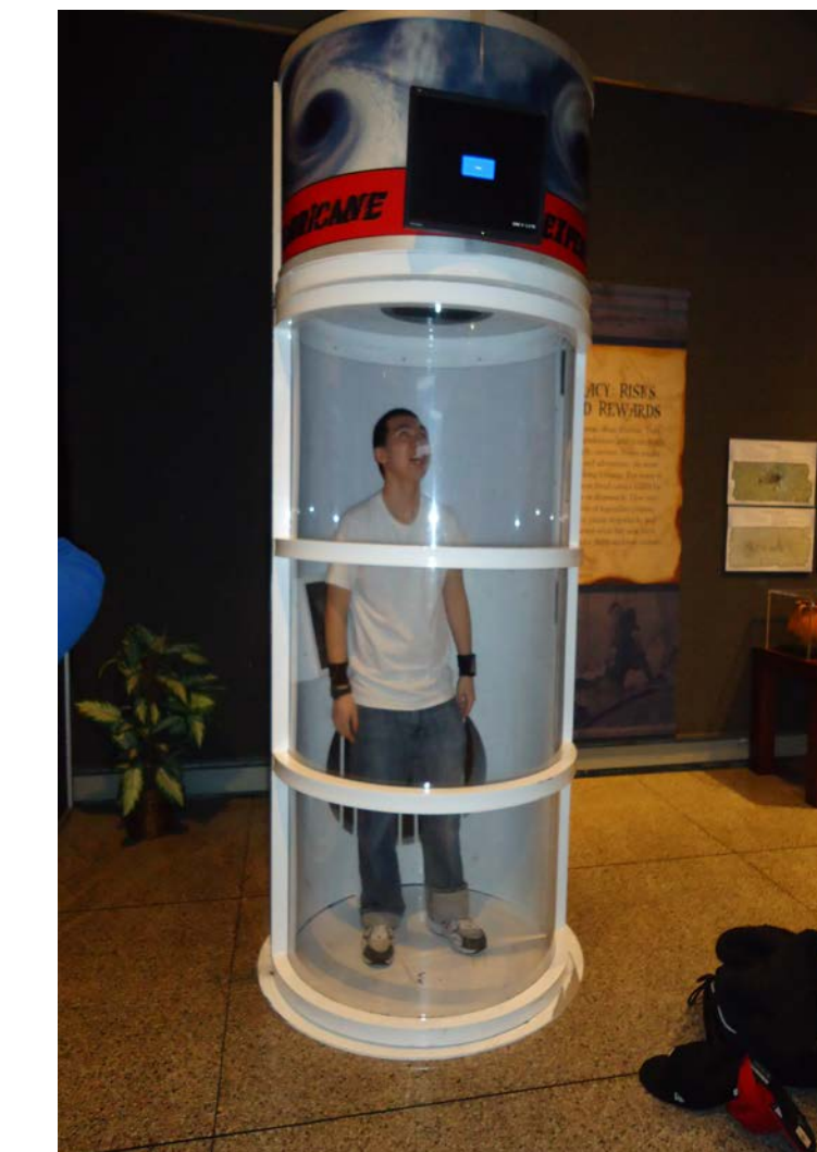
Program student in the Hurricane Simulator at the Science Museum in Boston.