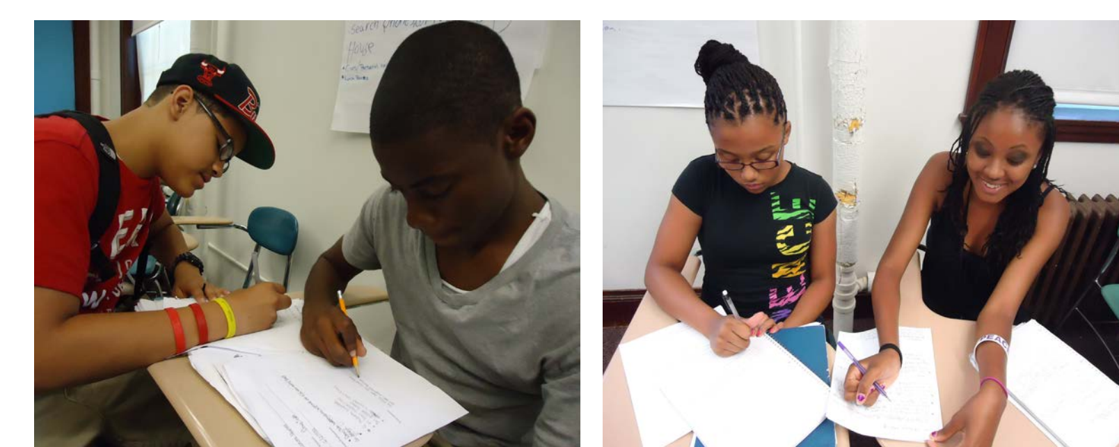
Summer academic courses