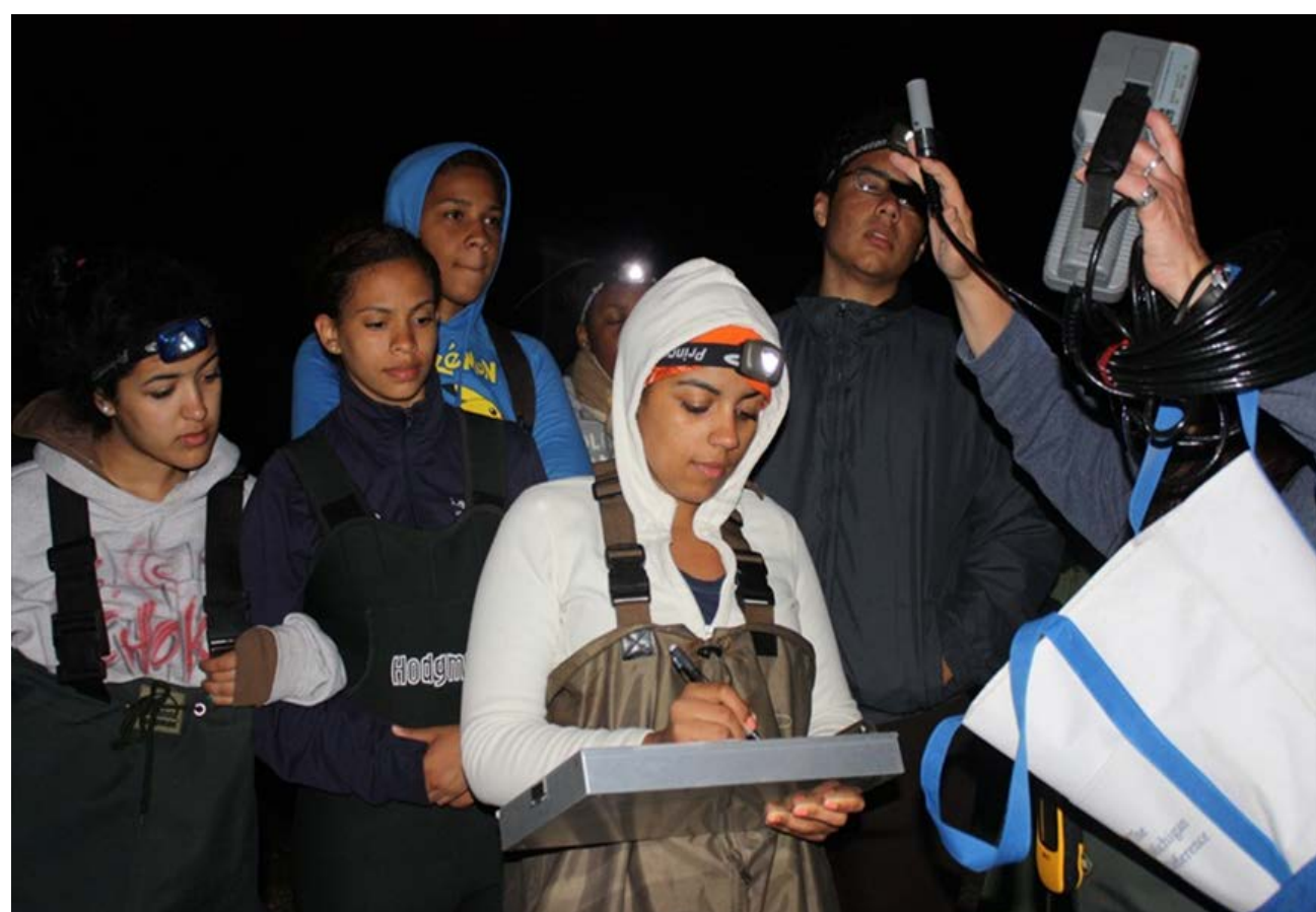
Horseshoe Crab counts for State... collecting real data in real time that real people need for managing the health and population of a species

To introduce students to science, help them meet role models in the fields of ecology, biology, land management and marine science and bond with classmates while experiencing the whole gamut of Nantucket's physical, historical, social, and biological nature.