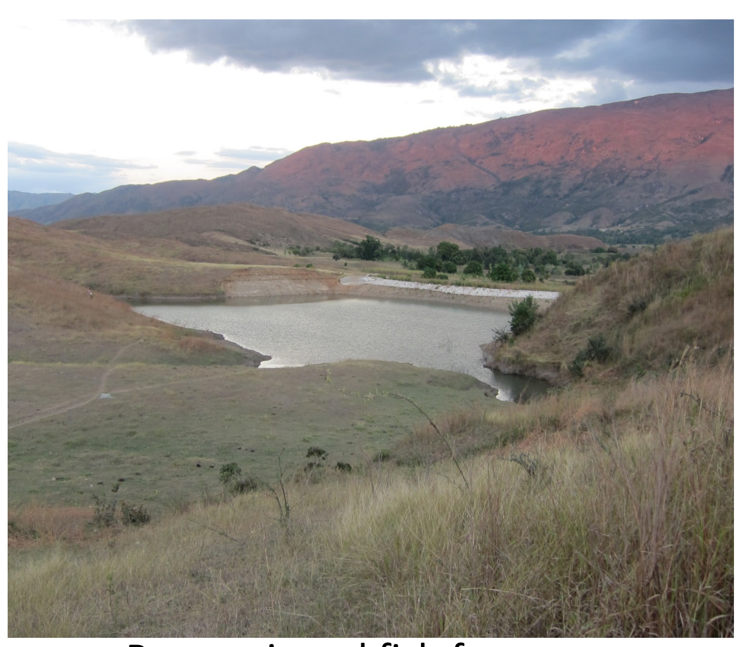
Reservoir and fish farm

leadership in the development of the infrastructure and resources of post-quake Haiti.