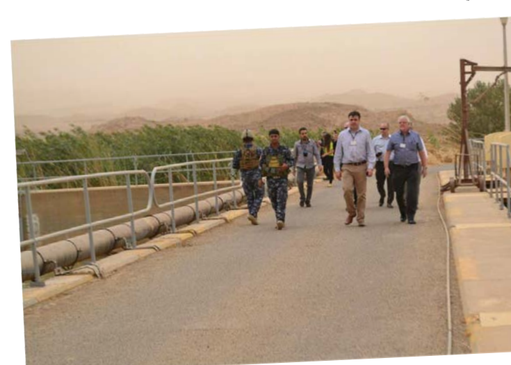
Site Visit to a local utility company (also to schools, business centers, religious/cultural centers, historical sites)