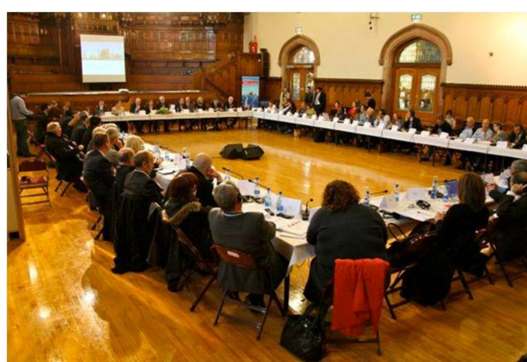
Derry-Londonderry, 2 nd Annual Conference