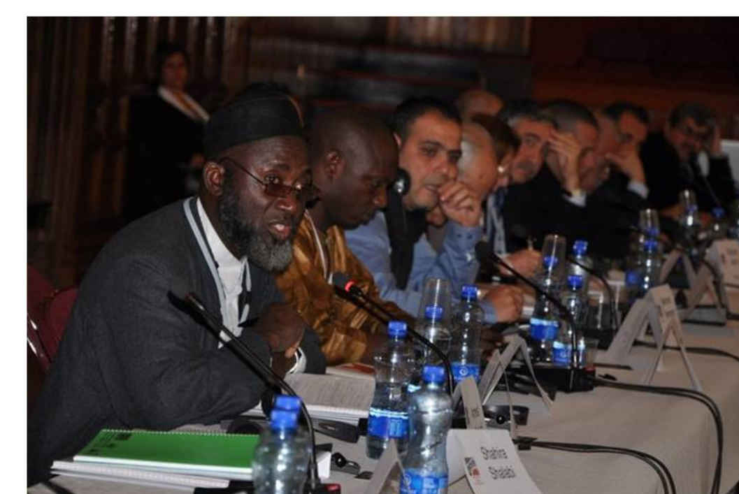
Telling their stories, voices of hope