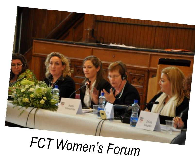
FCT Women's Forum