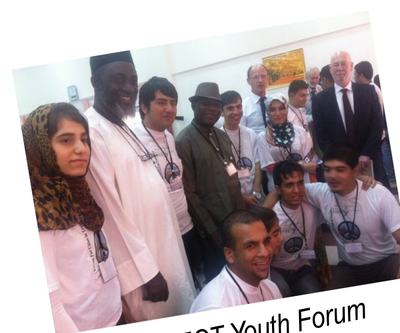
FCT Youth Forum