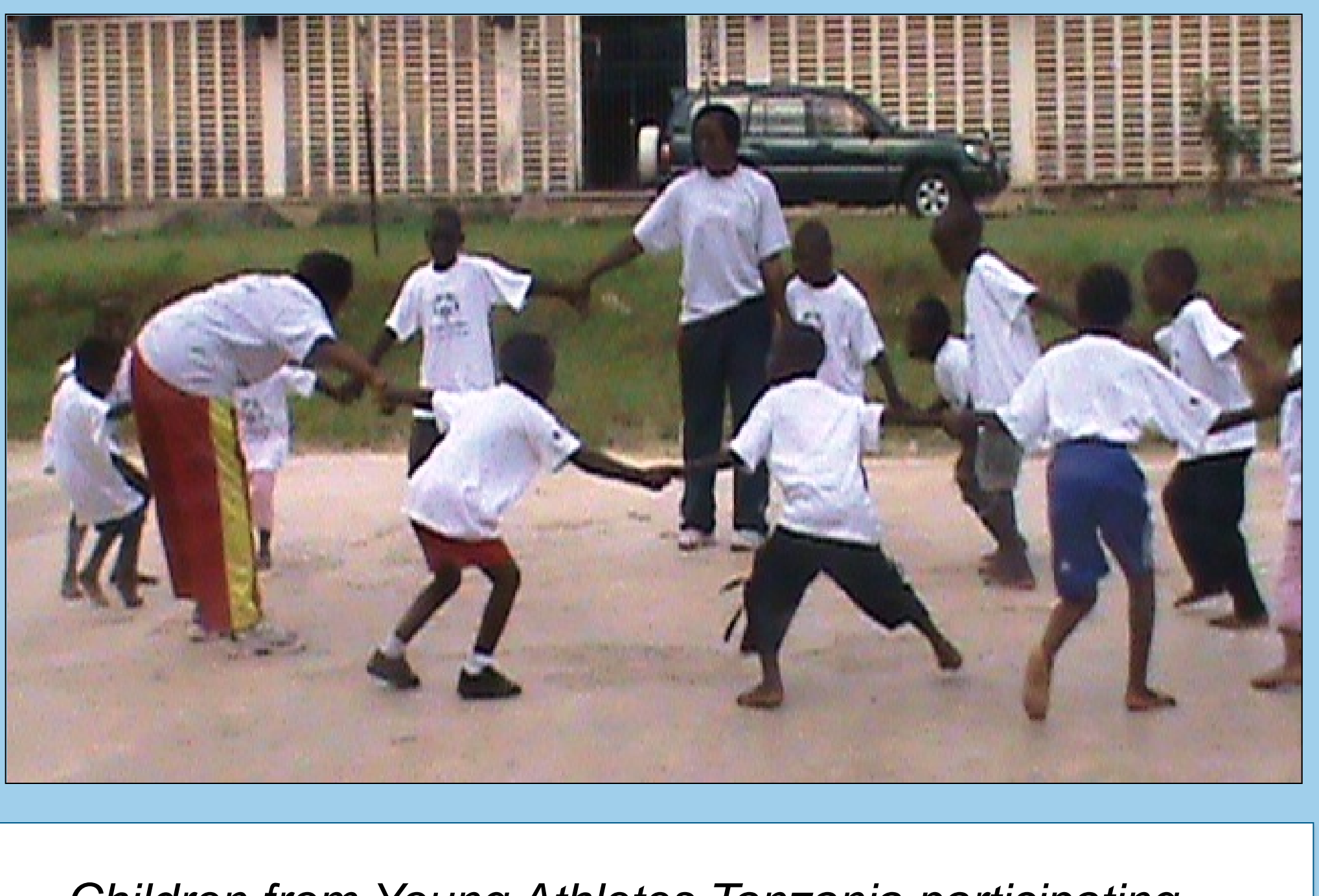
Children from Young Athletes Tanzania participating In a group dance