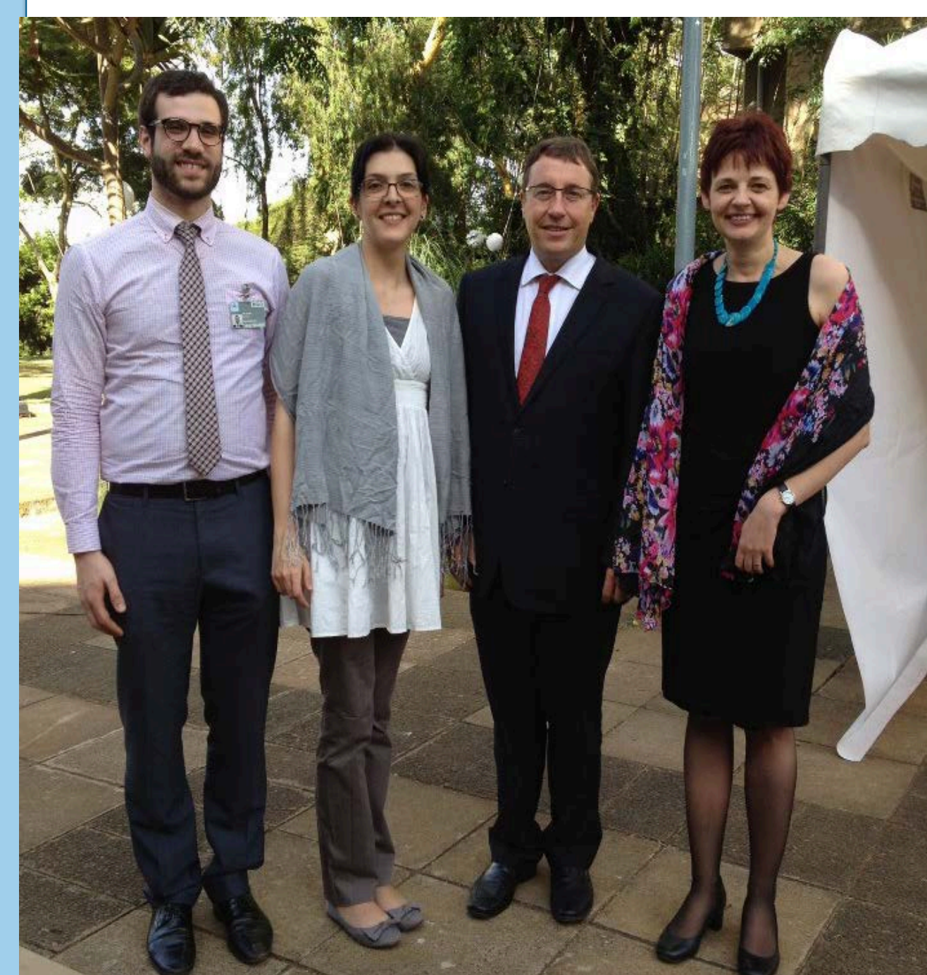
Center for Governance and Sustainability delegation with UNEP Executive Director Achim Steiner

Bringing analytical rigor into policy processes at the global level, the center has actively engaged with the UN and participated in the 2012 Rio+20 conference in Brazil and in the 2013 UN Environment Assembly in Nairobi, Kenya. We produce a documentary film series on global environmental governance featuring interviews with ministers, international organization officials and public intellectuals from around the world.