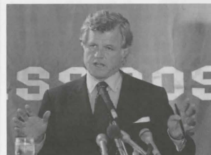
Senator Edward M. Kennedy addresses audience in Healey Library

UMass/Boston has become a national model for urban public education.