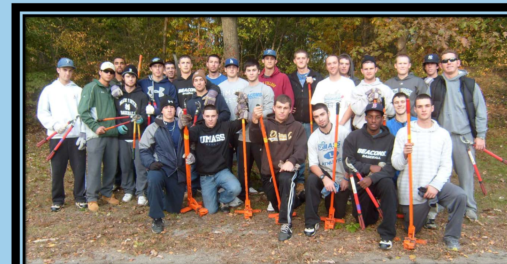
UMB Baseball - Franklin Park Coalition