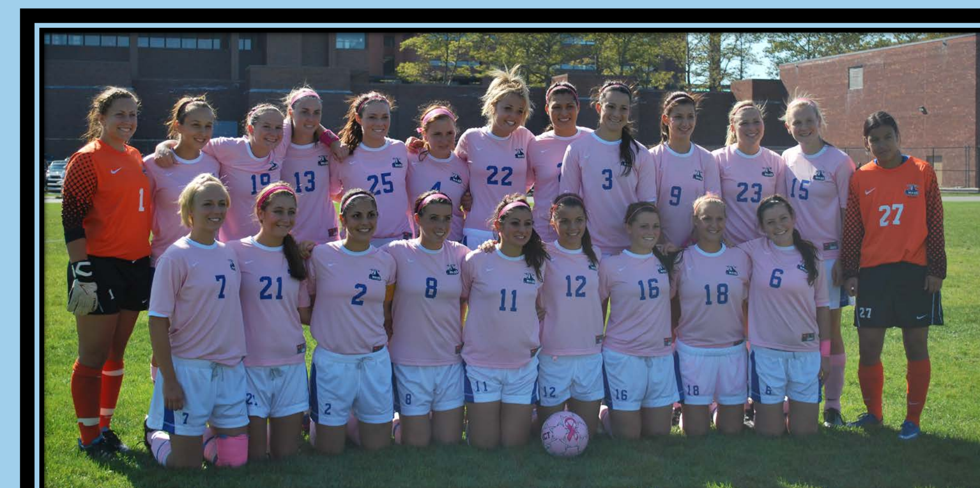
UMB Women's Soccer – Think Pink Game