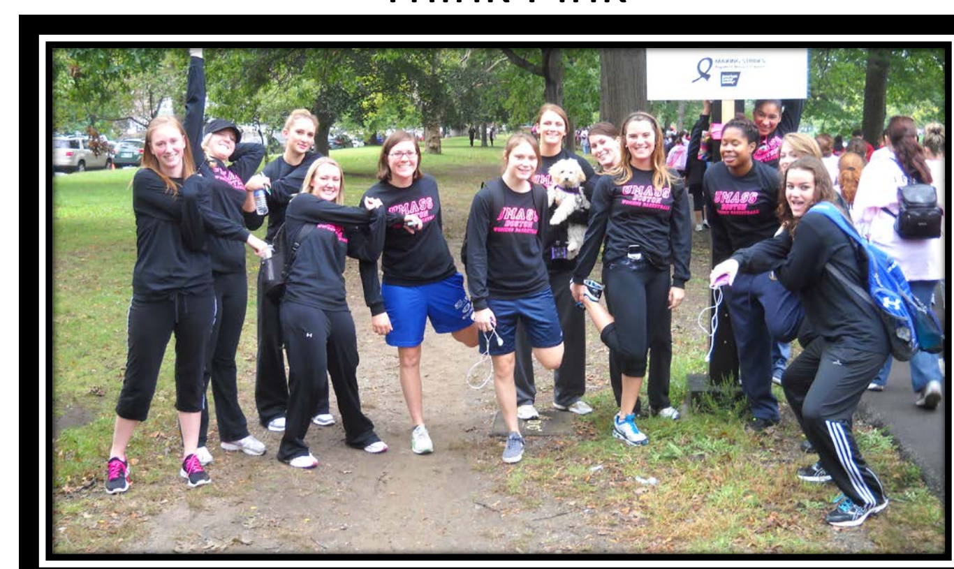
Women's Basketball breast cancer walk