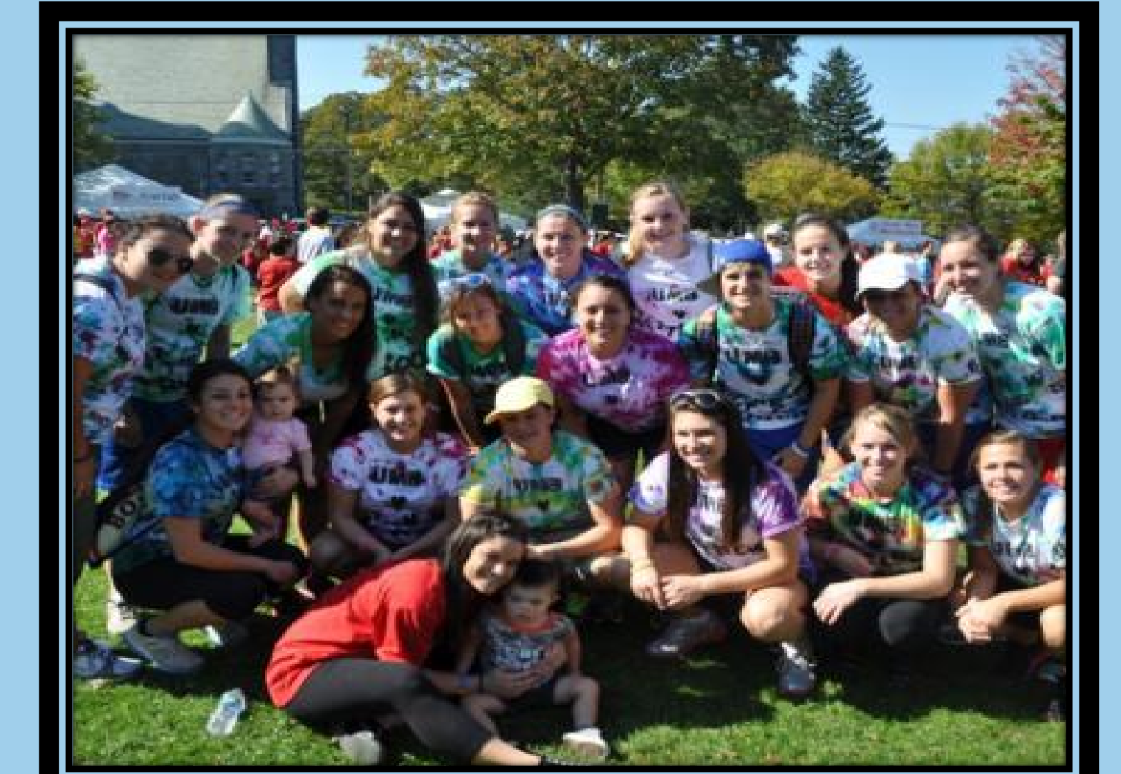
UMB Softball - Down Syndrome Walk