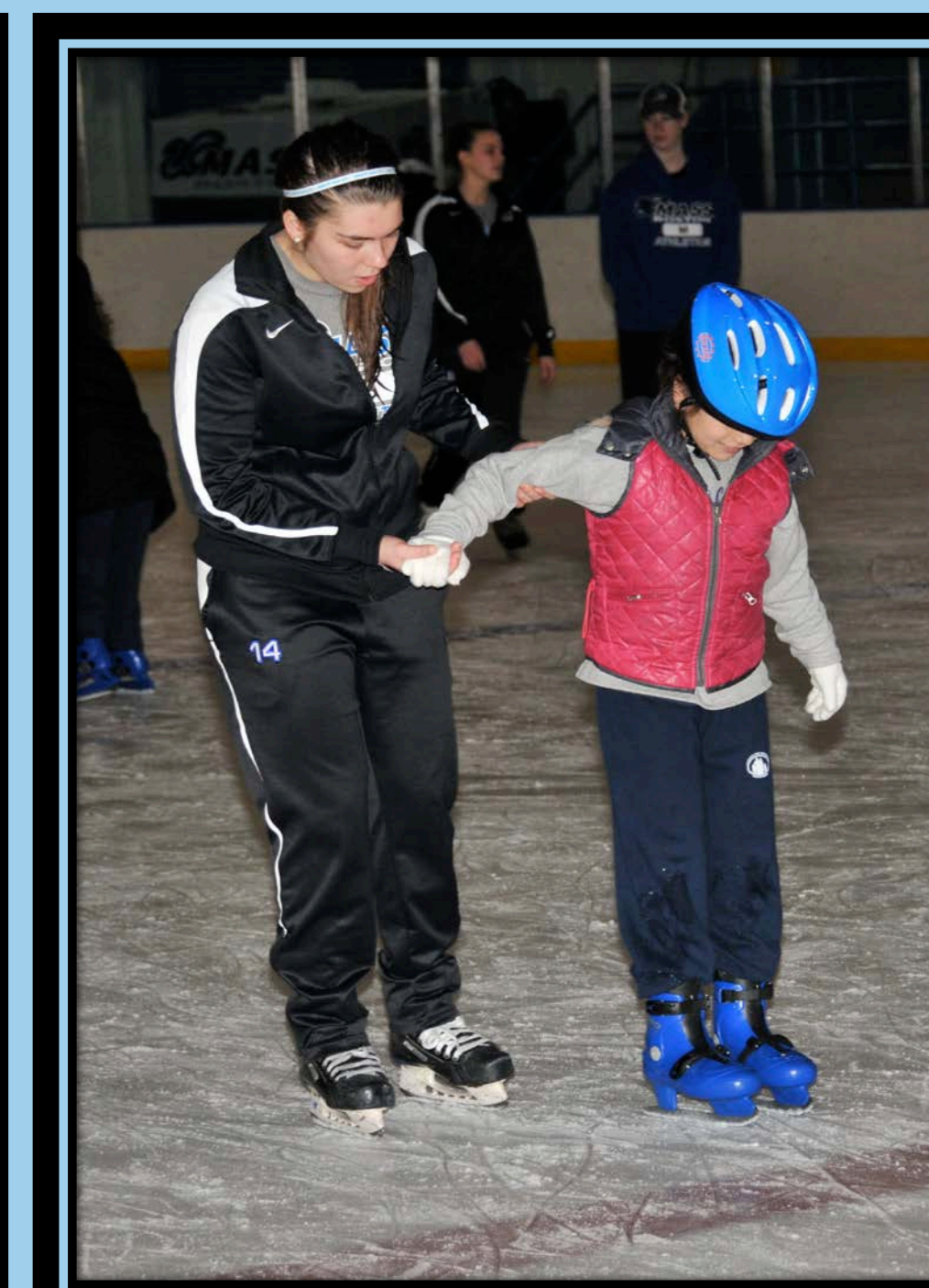
Men's and Women's Ice Hockey skate with the Lawrence Charter Schools