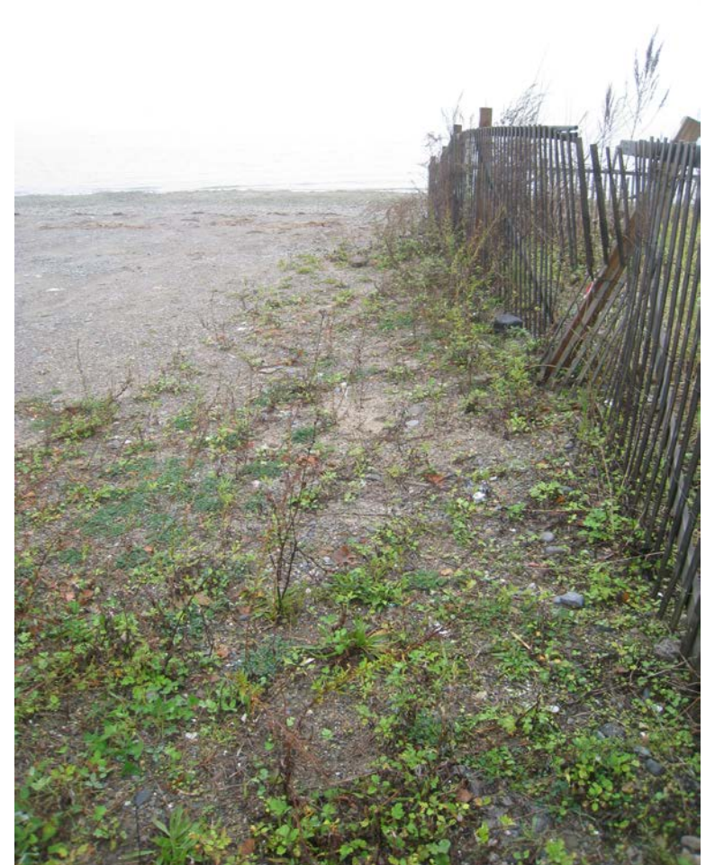
Before and After pictures of the shoreline near the Morrissey Blvd. Boat Ramp in Dorchester, MA