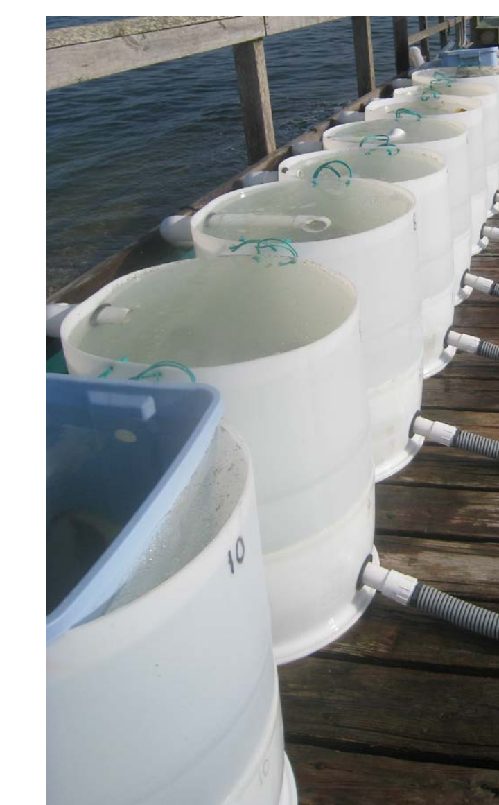
(Left:) Plastic barrels hold shellfish grown at the Brant Point propagation facility.