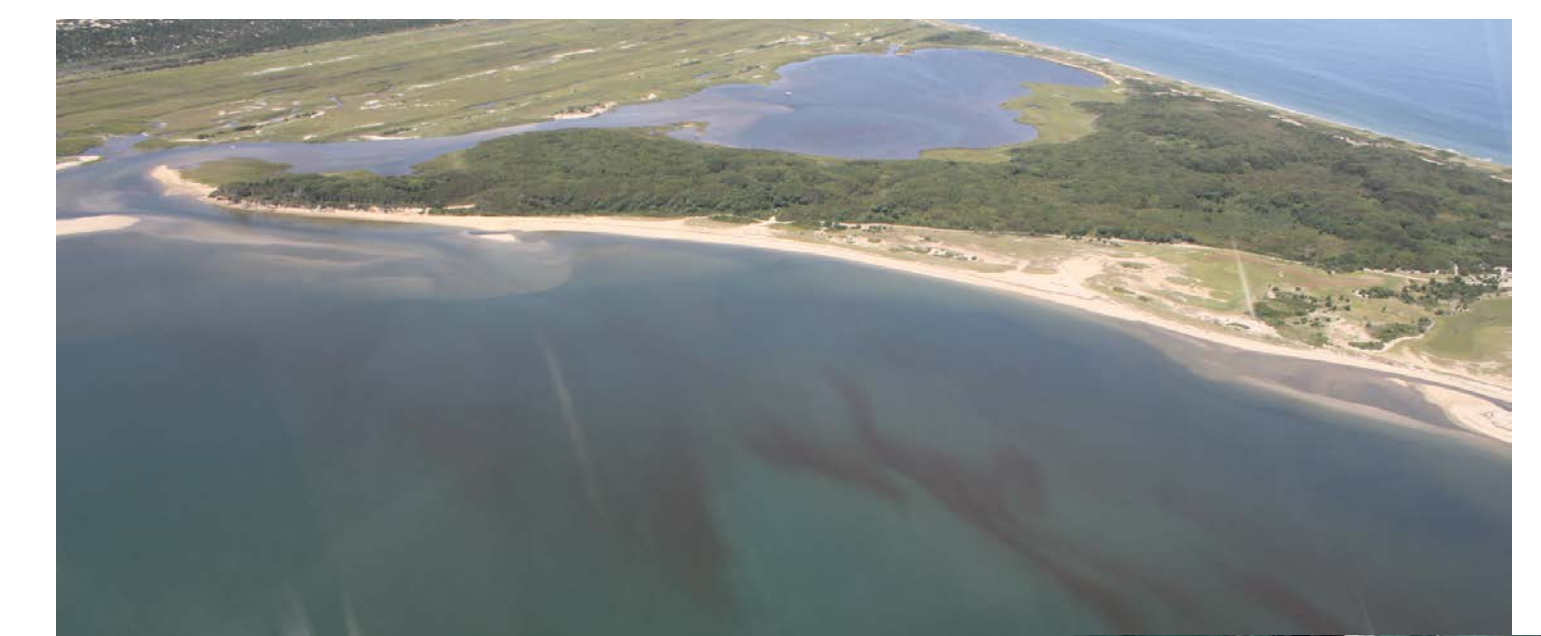
(Above:) Rust Tide in Nantucket Harbor is thought to impair shellfish functions.

While shellfish management plans have been developed in the past, this is the first effort supported by the Town, and developed with input from fishermen, managers, and researchers.