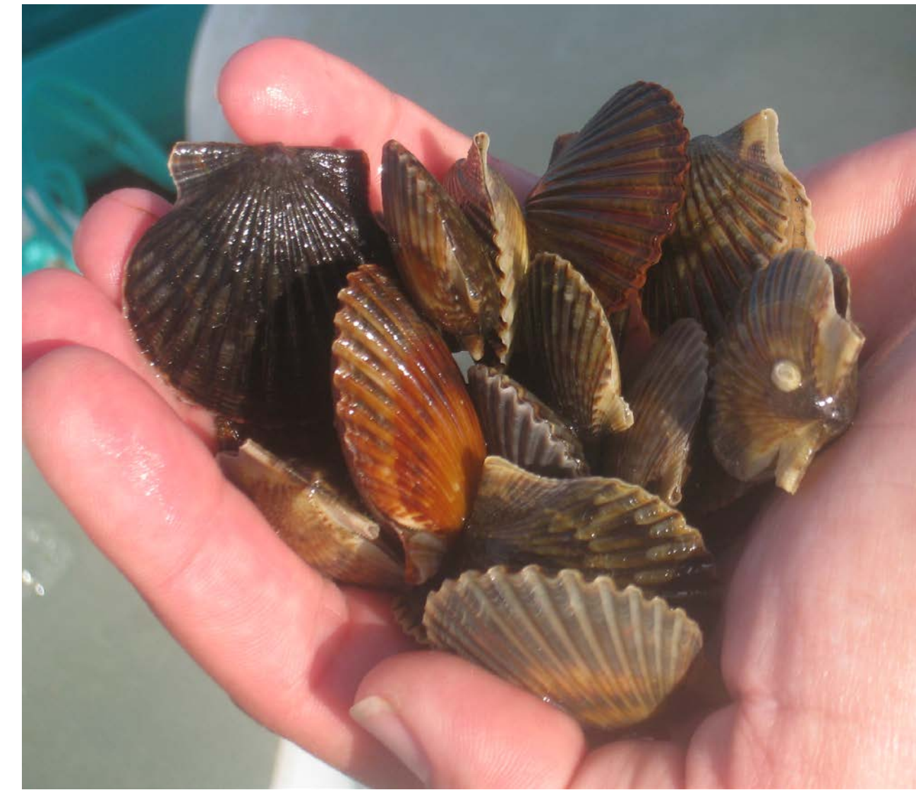
Bay scallops being grown out in a Nantucket propagation facility