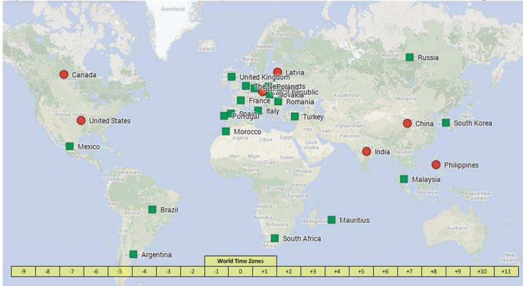
Figure 1b: Infosys’ service delivery centers in 2005 (dots) and 2013 (dots and squares)*