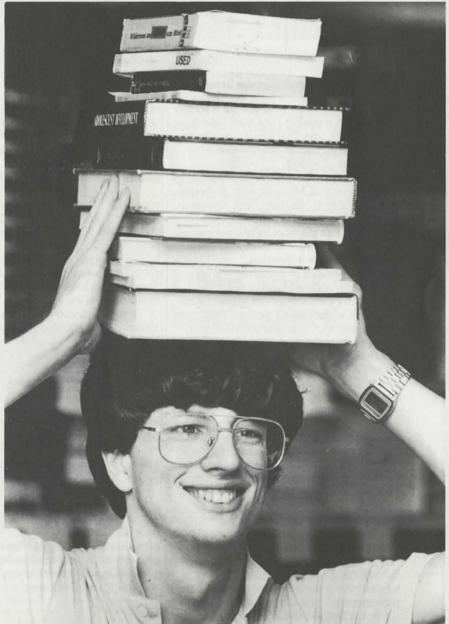
This smiling student lets his bookwork get to his head as classes opened for the 22nd academic year at UMass/Boston. The early weeks, as usual, will be hectic.