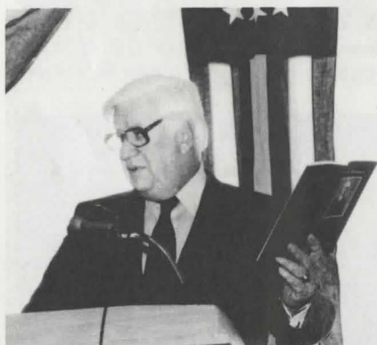
U.S. House Speaker Thomas "Tip" O'Neill, Jr. was the featured speaker at the McCormack Hall dedication.

John W. McCormack, a native of South Boston and a resident of Dorchester, was a member of the House of Representatives from 1928 to 1970, representing the Congressional District in which the Harbor Campus is located. He was Speaker of the House from 1962 until his retirement.