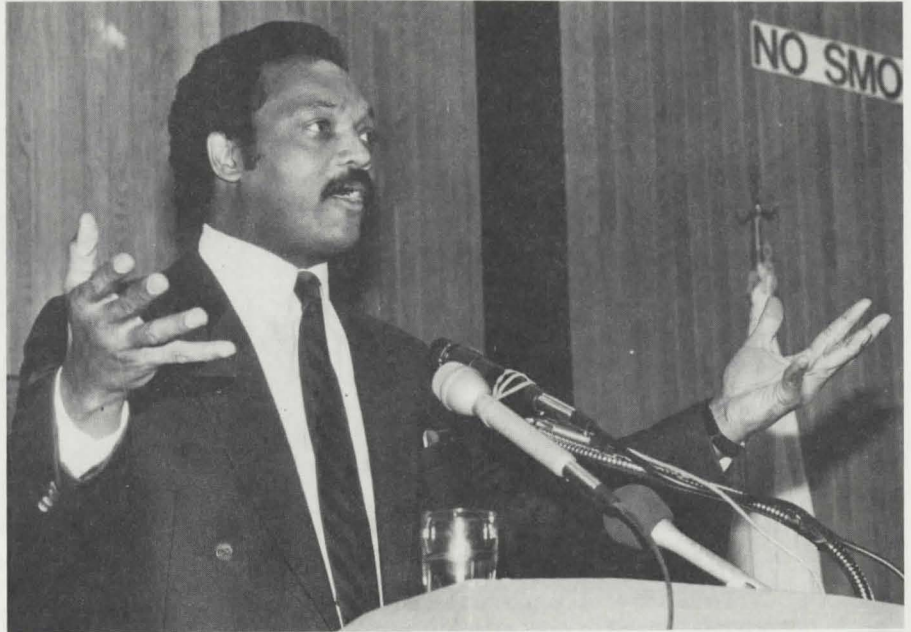
Rev. Jesse Jackson delivered a spellbinding address at UMass/Boston's Harbor Campus.

Rev. Jesse Jackson sounded like a man running for the presidency—again. Rev. Jackson delivered a spellbinding address at UMass/Boston on the 17th anniversary of the assassination of Dr. Martin Luther King, Jr.