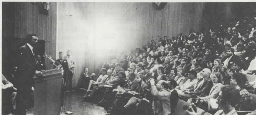
A jam-packed audience greeted Rev. Jackson as he spoke on the occasion of the 17th anniversary of the assassination of Dr. Martin Luther King, Jr. More than 500 were in attendance with an overflow crowd hearing the address via loudspeakers.