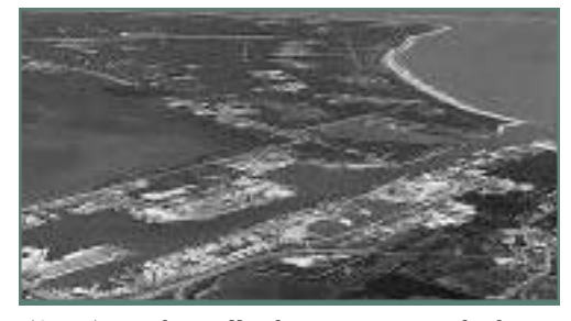
(Corps). Traditionally, this maintenance dredging had been done with a hopper dredge and the total volume of dredged material disposed of at an offshore disposal site nine miles at sea. In 1991, the US Fish and Wildlife Service prohibited further use of hopper dredges due to potential impacts on endangered sea turtles that inhabit the area. The Canaveral Port Authority developed and funded an alternative plan, known as the Nearshore Berm

The entrance and channel basins are dredged annually by the US Army Corps of Engineers