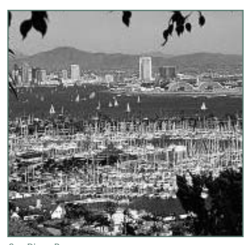
San Diego Bay.

Following successful completion of the pilot study, the Port proceeded with dredging and remediation of 21,000 cubic yards of sediment. Due to a low volume of high copper content sediments and refinements in the physical separation process, the chemical extraction process was not necessary during full-scale remediation. At the end of the physical separation process, cement was added to the low level and washed sediment and the material was placed onsite. The innovative sediment treatment system implemented at the San Diego Unified Port District not only remediated the sediment contamination, it also saved the Port approximately $1.5 million in cleanup costs over other, more conventional methods.