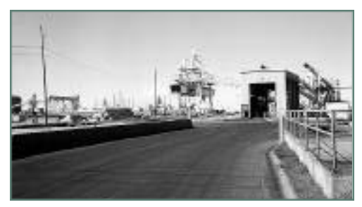
Stormwater filtration system and shiploader.