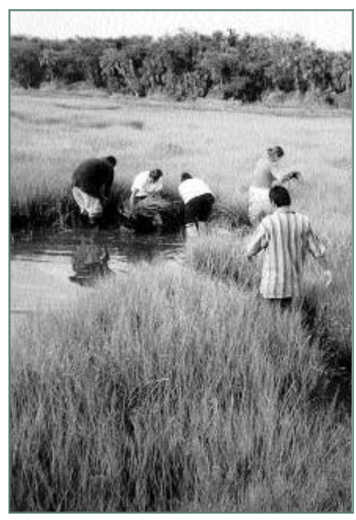
Volunteers harvest saltmarsh grass at Port Manatee.

The Manatee County Port Authority assisted the Florida Department of Environmental Protection (DEP) with implementation of an innovative integrated management system for wastewater discharged from the agency's Stock Enhancement Research Facility (fish hatchery) which is located on Port property. The Port's assistance was sought because of its experience in engineering design and construction and because the Port Authority is a "certified governmental entity" which DEP could contract with at considerable cost savings.