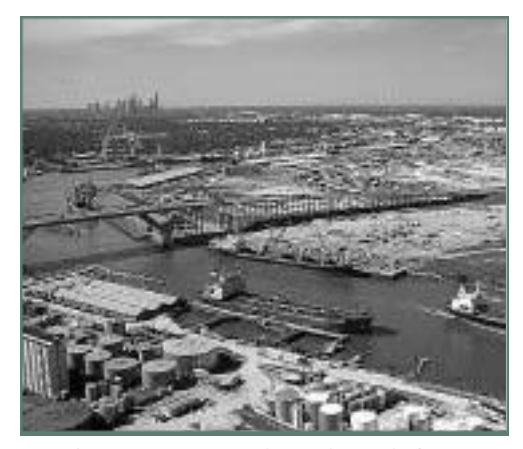
Port of Houston, Texas, Turning Basin Terminal.

In 1995, the Port of Houston Authority (PHA) proposed widening and deepening the Houston Ship Channel. One obvious impact was that approximately 118 acres of primary oyster reef habitat that bisect the channel would be destroyed by the proposed project. Any potential indirect impacts to neighboring reefs were ruled out by the coupling of a hydrodynamic model designed by the US Army Corps of Engineers Waterways Experiment Station and a population dynamics model developed by Texas A&M and Old Dominion universities that permitted full-scale simulations of oyster populations in the area.