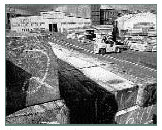
Old growth timbers reused at the Port of Portland.

In addition to maintaining its recycling program, the Port has initiated several innovative projects that recover used materials for alternative uses. In one project, old growth timbers were recovered from an old warehouse. In preparation for redevelopment of a terminal area, the oldest warehouse in the Port was carefully dismantled. The recovered timbers were remilled and then incorporated into other construction projects, such as Port building lobbies and meeting rooms