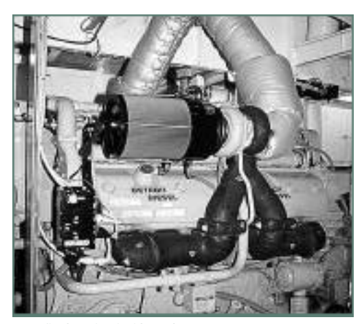
Retrofited engine inside tugboats.

injection of diesel fuel at lower peak combustion temperatures, and (2) supplying the lowest temperature water by the jacket water-sea water keel cooler to charge the air cooler. With earlier injection, combustion temperature is lower and the adiabatic temperature increase is less. In addition, passing the engine water through the ocean bathes the cylinders in a cooler solution and reduces the air temperature prior to compression, which further decreases the combustion temperature. Keeping the combustion temperature as low as possible optimizes engine efficiency, reducing nitrous oxide, overall emissions, and fuel consumption. The boats now achieve a 25 percent reduction in air emissions. The use of new electronically controlled diesel engines is expected to result in longer time between overhauls, reduced maintenance, better engine performance, and decreased fuel consumption because of increased combustion efficiency and decreased mechanical wear. It was determined that this new design could be retrofitted easily into all pilot boats to ensure that the air emission standards are met.