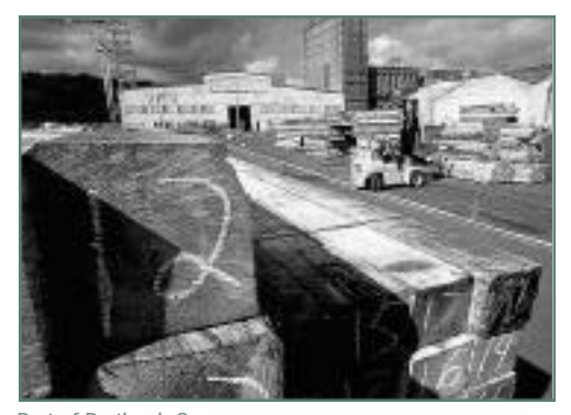
Port of Portland, Oregon.

As with many environmental problems, public concern comes before the necessary programs and regulations to ratify the problem are established. When this group first convened, there were no air toxic programs in place that it could use as a model. Instead, because of its success, this project is now used by the Oregon Department of Environmental Quality as a model for technical and community feedback in its design of a state hazardous air pollution program. The Port of Portland received the 1997 Environmental Improvement Award from the American Association of Port Authorities.