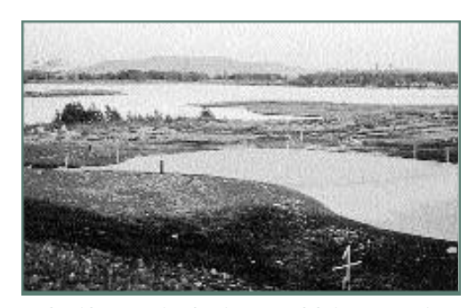
Harborside International as it appeared during construction.

The proliferation of brownfield redevelopment is one component of the solution to the growing problem of urban sprawl. By targeting once-built land for new commercial and industrial activity, the need to develop agricultural lands and other open spaces—so called "greenfields"—is reduced.