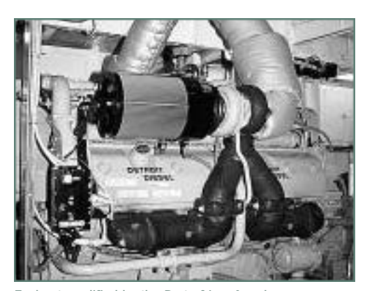
Tugboat modified by the Port of Los Angeles

Two tug-boats were retrofitted by the Port of Los Angeles to incorporate state-of-the-art environmental equipment and design. These boats included features that reduce air emissions, reduce waste