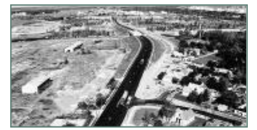
Improved roadways at the Port of Toledo.

Port uses state program to mediate cleanup of non-Port property.