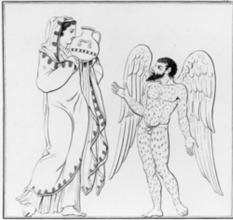
Figure 1: Plate 35 from Tischbein 1791-1795, I.

her hair 2 . The mantle has a decorated border; an ankle-length chiton with close pleats is visible beneath it. Her face is in profile and three large beads of a necklace can be seen at her throat. She holds the hydria up to her chest with both hands; her hands are covered by the folds of the himation. The hydria is somewhat round, with no real shoulder, and is decorated below the handles with a simple band of alternating dark and light squares. She stands in contrapposto, with her weight on her left leg, as she observes the creature approaching her.