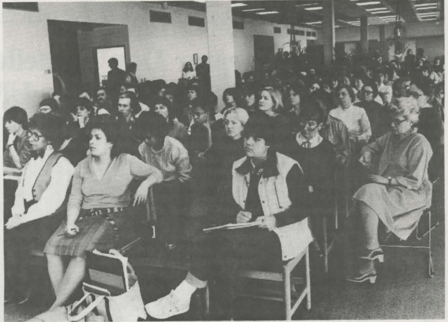
More than 200 people jammed the Faculty Club Lounge to hear Dr. Robert Coles at the first in the Distinguished Lecture series celebrating UMass/Boston's 20th Anniversary.