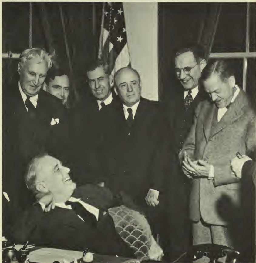
President Franklin Delano Roosevelt, John W. McCormack, and members of Congress

which these men would contribute so much. John McCormack served the House leadership as a loyal and effective lieutenant, and he was rewarded with an unprecedented appointment to the powerful Ways and Means Committee after only two terms in office.