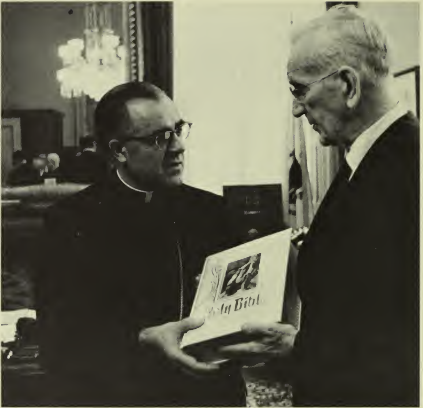
Humberto Cardinal Medeiros and John W. McCormack

At the funeral mass, on Tuesday, November 25, 1980, Humberto Cardinal Medeiros, Archbishop of Boston, was the principal celebrant, and moving eulogies were delivered by Massachusetts State Senate President, William Bulger, and by Thomas P. O'Neill, Speaker of the U.S. House of Representatives. Senator Bulger, who represents today the same area that John McCormack represented in the 1920's, spoke first: