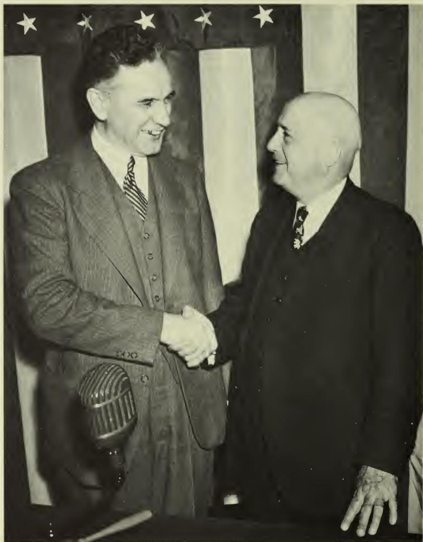
John W. McCormack and Speaker Sam Rayburn

Committee, and in 1958 he sponsored the bill creating the National Aeronautics and Space Administration (NASA), the agency that put the first men on the moon.