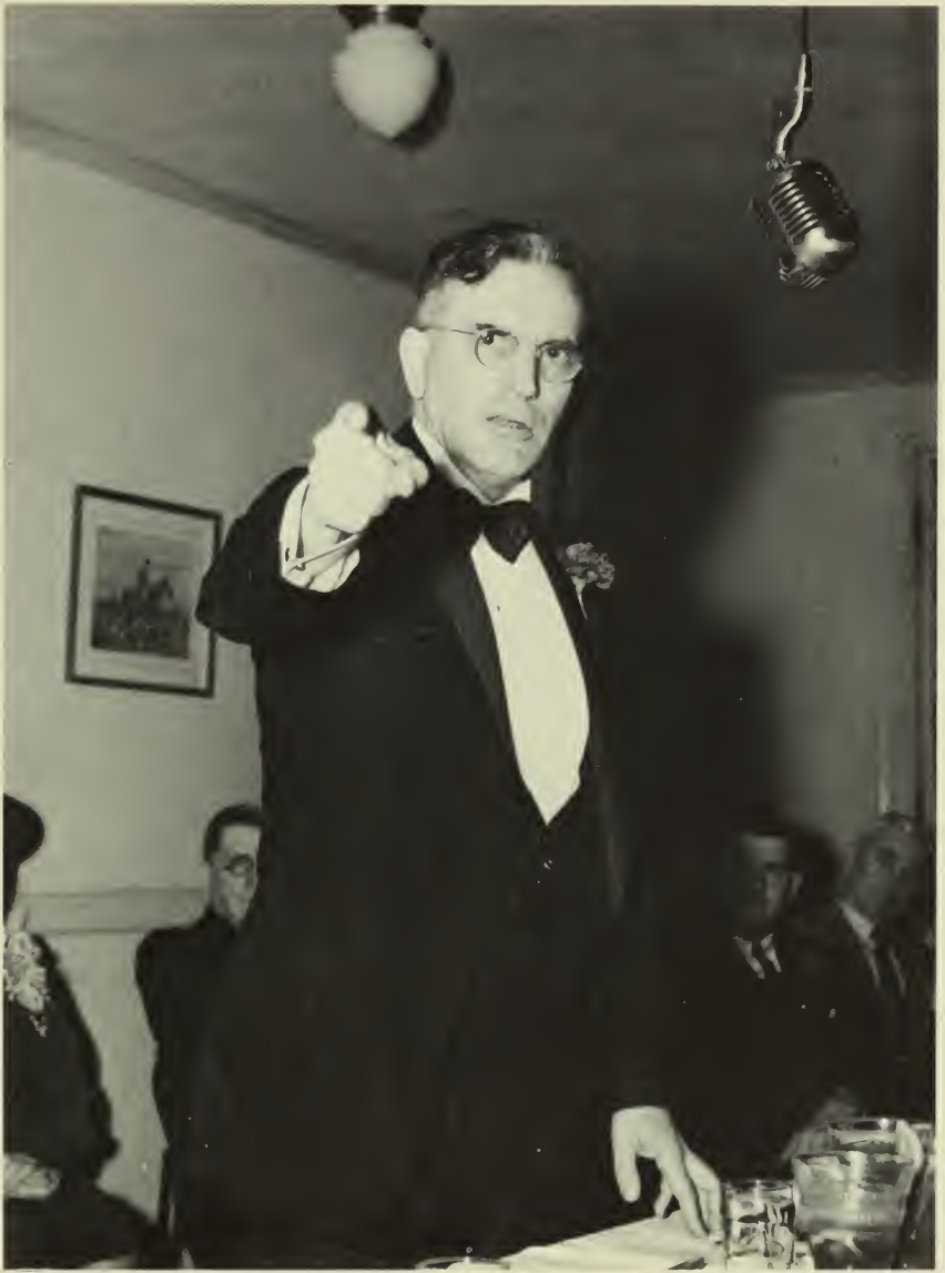
John W. McCormack, the "fighting Irishman from Boston"