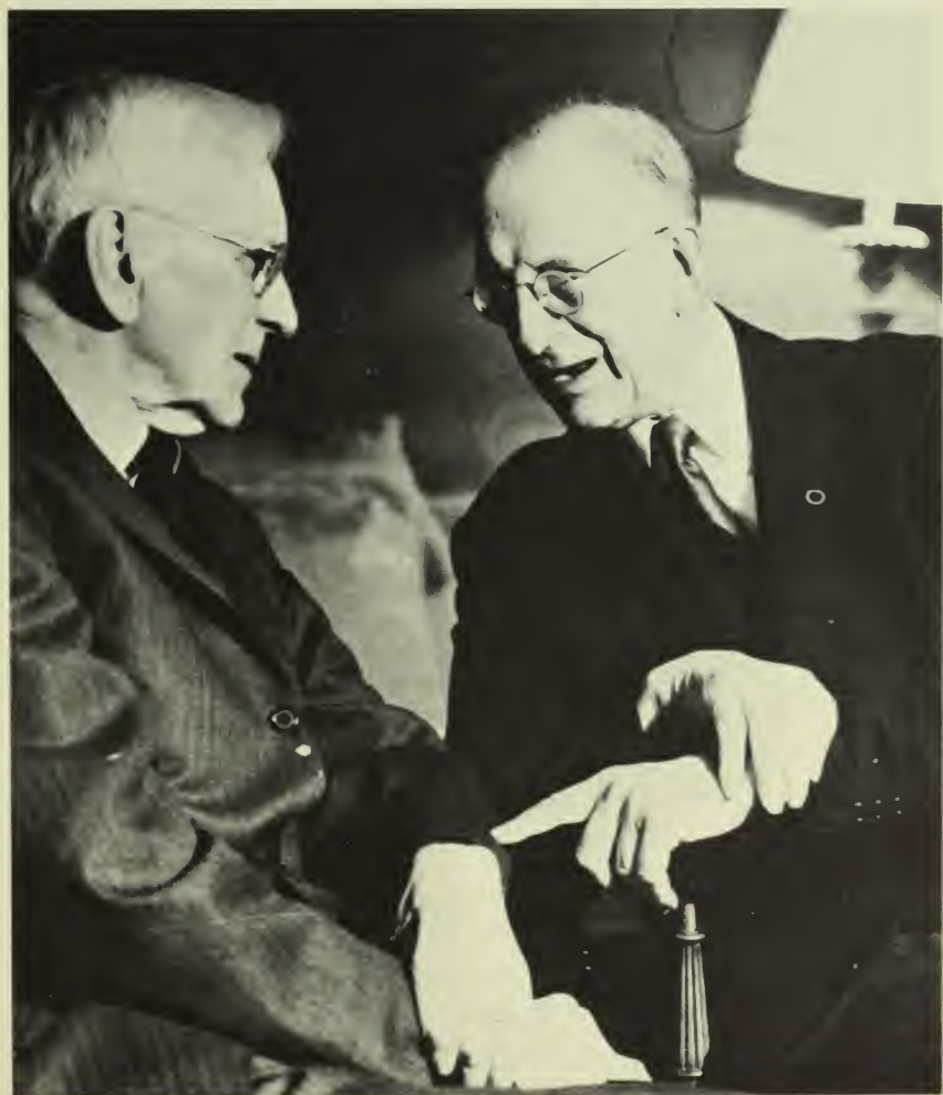
John W. McCormack and Eamon de Valera, Dublin (1972)

under his arm heading out or a determined young man with a load of lawbooks heading home. Every half hour a shuttle bus runs through Andrew Square, down Preble Street past the end of Vinton, makes the corner at St. Monica's, and heads down Old Colony Avenue — a railroad right-of-way in 1891 — loaded with students heading for UMass/Boston. Is it too much to imagine that a future Speaker of the House is among them?