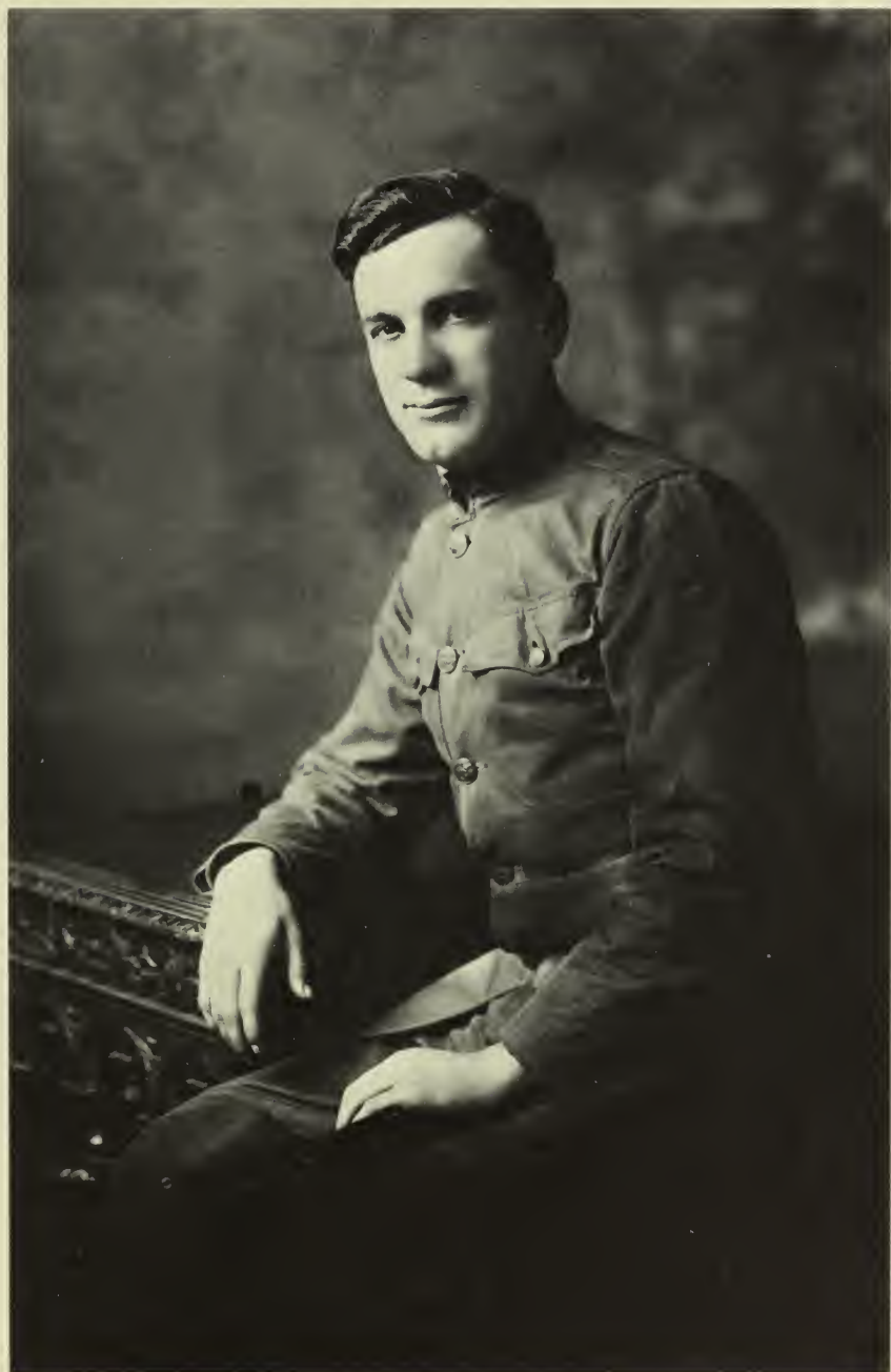
John W. McCormack in World War I uniform (1918)