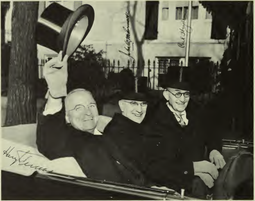
President Harry S. Truman, John W. McCormack, and Carl Hayden, Inauguration Day, 1949

Irish-American Bostonian. The tragic assassination of President Kennedy, on November 22, 1963, meant the elevation of Vice-President Lyndon B. Johnson, also a protege of Sam Rayburn, to the Presidency, and placed Speaker McCormack next in line of succession. This was a position in which he was never comfortable, often acknowledging that he prayed nightly for President Johnson's continued good health.