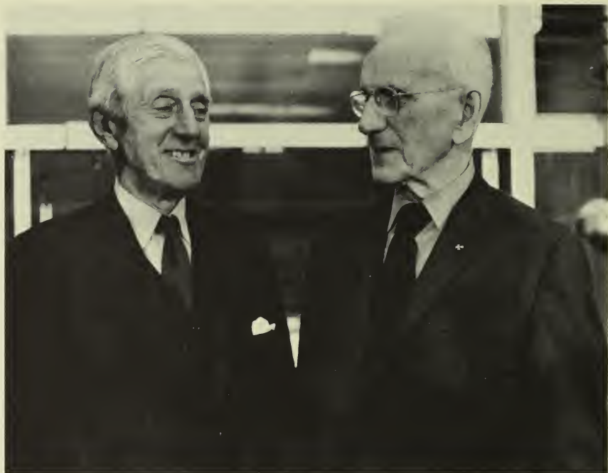
Leverett Saltonstall and John W. McCormack

House, knew of the Speaker's love for the Horatio Alger stories. "Those books should be a must for all children," the Speaker told the Herald in 1970. "They appeal to the constructive side, they build character. They made an impression on me." Congressman Moakley knew his man and said to the Boston Globe : "Speaker McCormack was the Horatio Alger of politics. He started out as a young boy in South Boston, put himself through school and then followed the steps up the political ladder. . . . He made a great, great mark not only on Massachusetts but on the entire country."