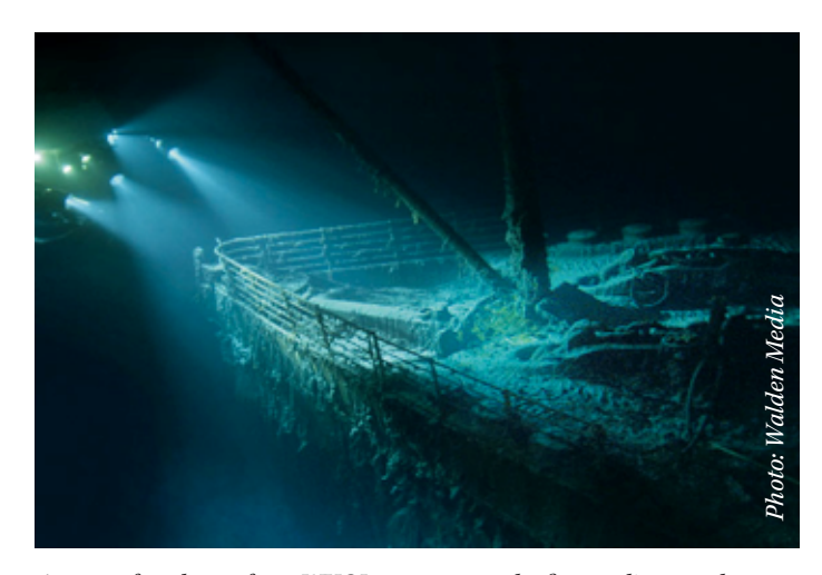
A team of explorers from WHOI were among the first to discover the wreckage of the Titanic in 1985.

of your research. Creating a broader problem context and encouraging collaboration with others who have different disciplines is where academia could really help.