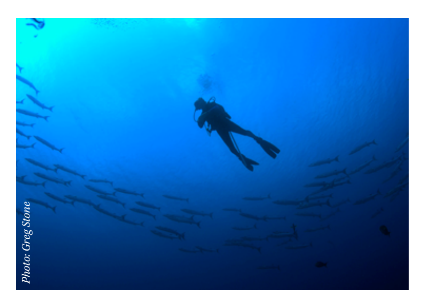
A researcher from WHOI explores the coral reefs around Phoenix Island. This marine preserve has remained relatively untouched by humans and serves as a case study for climate change scientists.

First, we need scientific leadership that is going to continue to explore the interdisciplinary boundaries. For the planet, climate is not just an atmospheric phenomenon. Lots of people think that way, but climate is putting all of the pieces together: the climate-ocean interface, the climate-ocean-land interface, and the climate-ocean-ice-land-